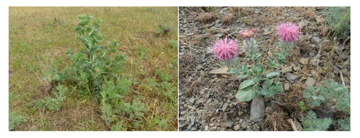
Figure 1 Cousiniarezinoza

Features of Biology and Ecology, Growth and Development of Cousinia Species in Various Ecological Conditions of Uzbekistan