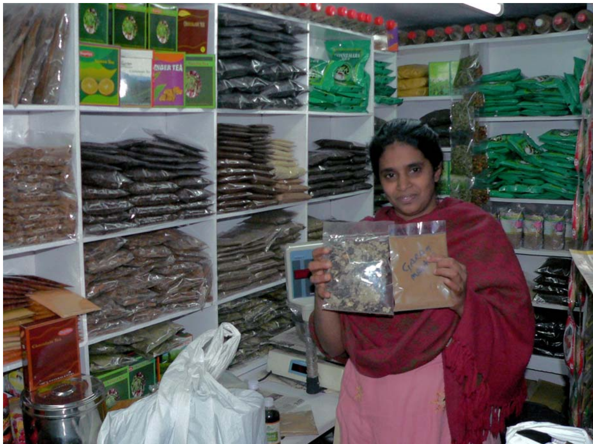
A Kerala Spice Shop

In any case, next time when you are enjoying a curry dish at your favourite Indian restaurant, you may want to contemplate which lichens helped create its flavour, from which forest these originated, and through which hands these passed.