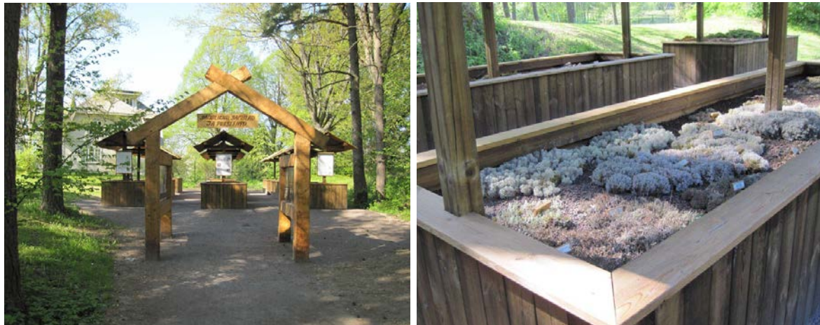
Entrance to the exhibition (left), reindeer-lichens in wooden outdoor containers (right).