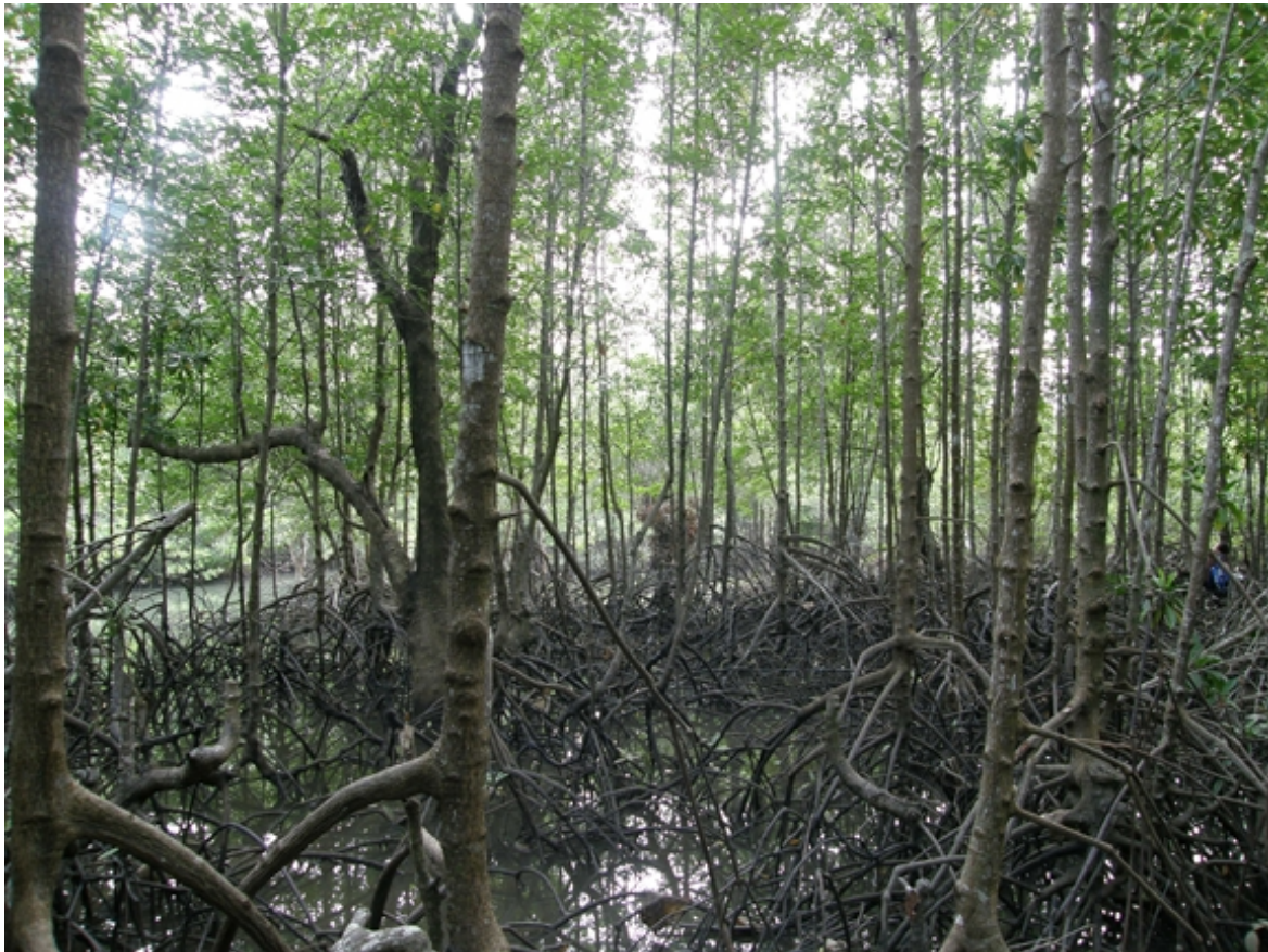
Photo 1: Our first acquaintance with mangroves ...

On Monday we visited the mangrove forest of the new visitor centre of Had Sai Dum (Black Sand Beach) where we had the opportunity to collect lichens in the forest and relax under the sun for a short period of time. After lunch we went to the Sepang Hin Waterfall in a tropical rainforest close to the Cambodian border to collect lichens from various habitats. It was very hot and humid: perfect conditions to rest close to the torrent with our feet in the water!