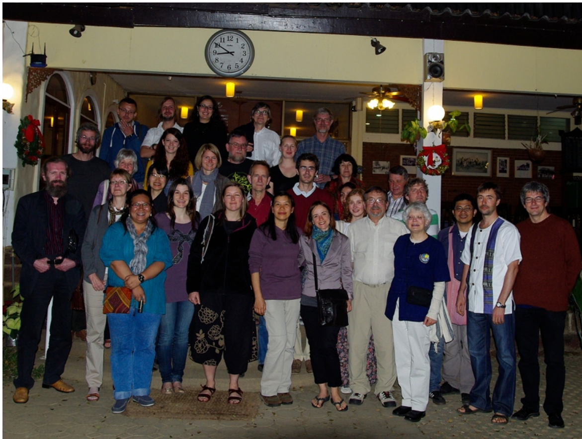
Participants of the Himalayan foothills tour.

which opened in 1994, has been working hard to restore degraded tree stands in the north of the country. A tour of the laboratory gave us a glimpse into its efforts to regenerate Thailand's forest resources and ecosystems. The day ended with a moment of respite and reflection at the Wat Phrathat Doi Suthep, one of the most important Buddhist temples in Thailand. Constructed on Doi Suthep by King of Lanna in 1385 at the site where a holy elephant carried the bone of Buddha, it is now part of the Pui National Park.