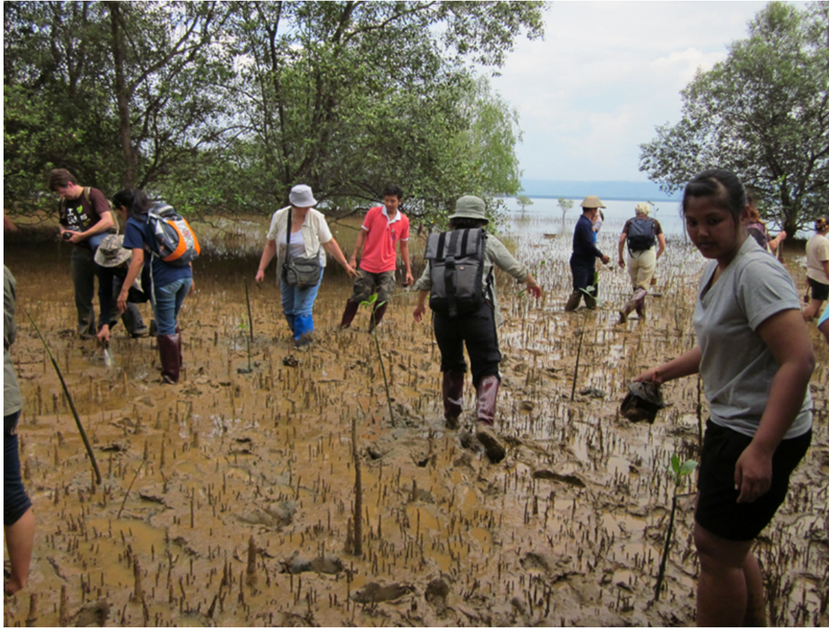
Photo 2: Planting of mangrove trees for reafforestation.

of this last part of summer before many of us returned to colder climates! Then, unfortunately, we had to say goodbye to this beautiful country and to new good friends with the promise to keep in touch.