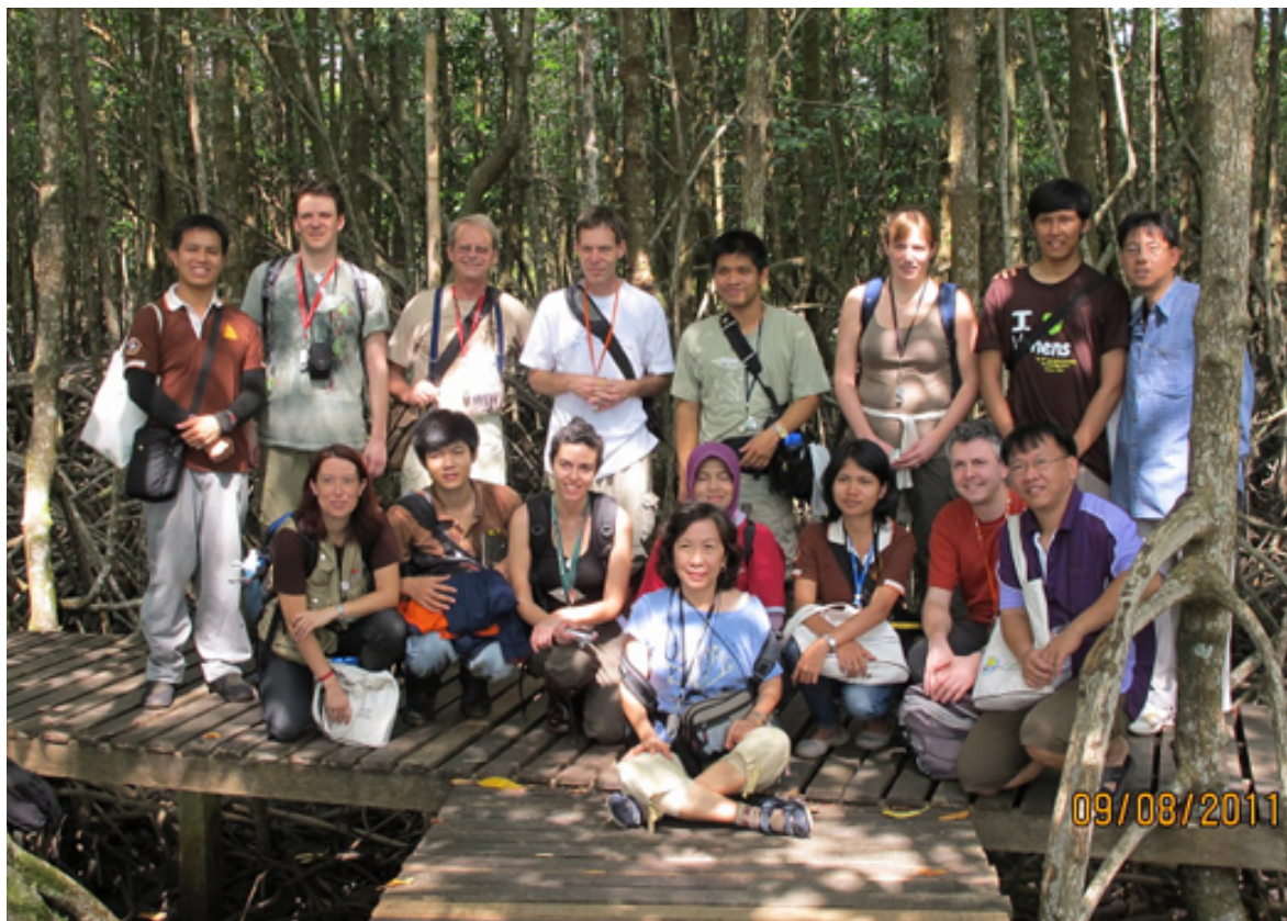
Participants of the Tropical Lichen Workshop at the mangrove forest in Had Sai Dum.