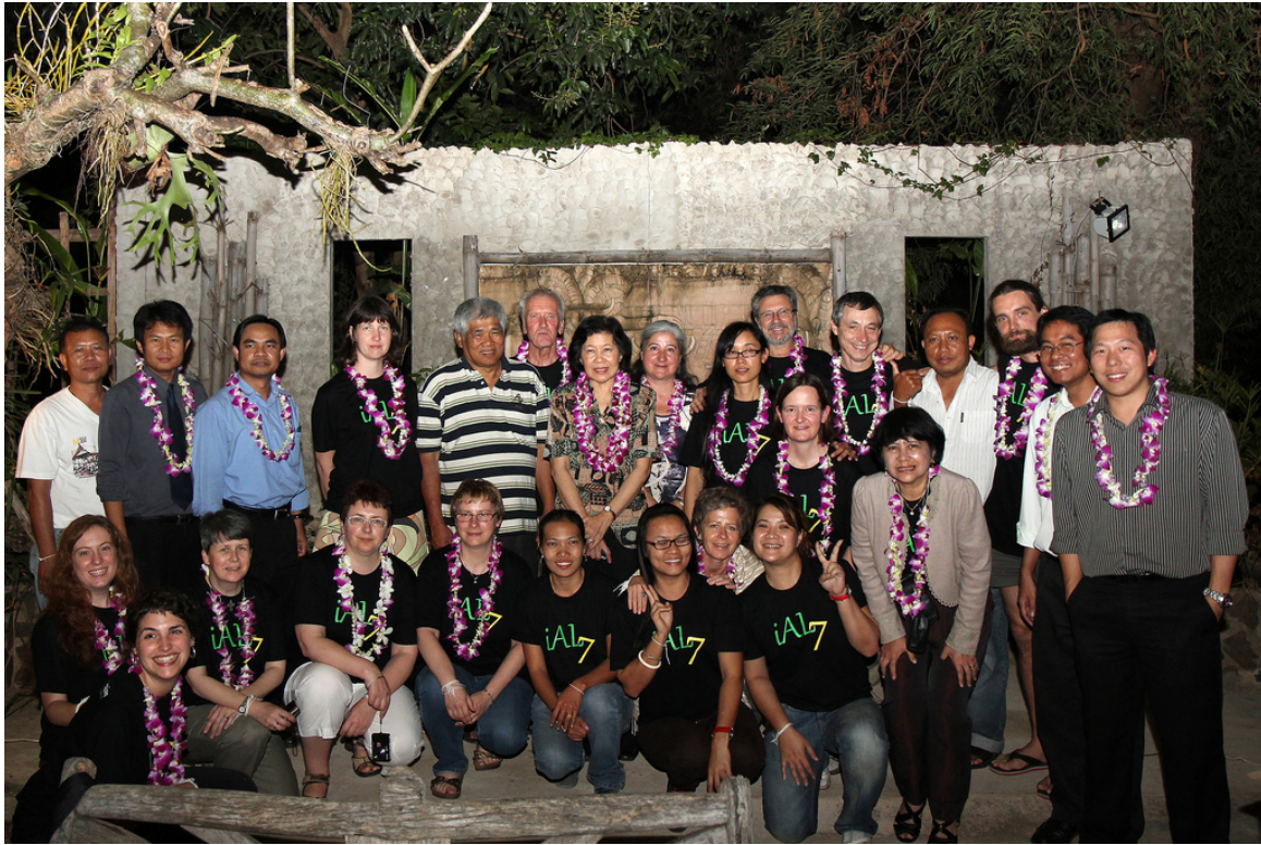
Group photo at Kung Nam restaurant next to Chi river in Maha Sarakham

from the forest. Step by step forests at lower parts of the hills had become eucalyptus, cotton, cassava or rubber tree ( Hevea ) plantations. Forests are retained only on hill tops, but even these are frequently cut to supply construction material for local houses or for sale at the market. Despite prohibition, trunks of valuable tree species are still cut down for sale in illegal Chinese furniture markets.