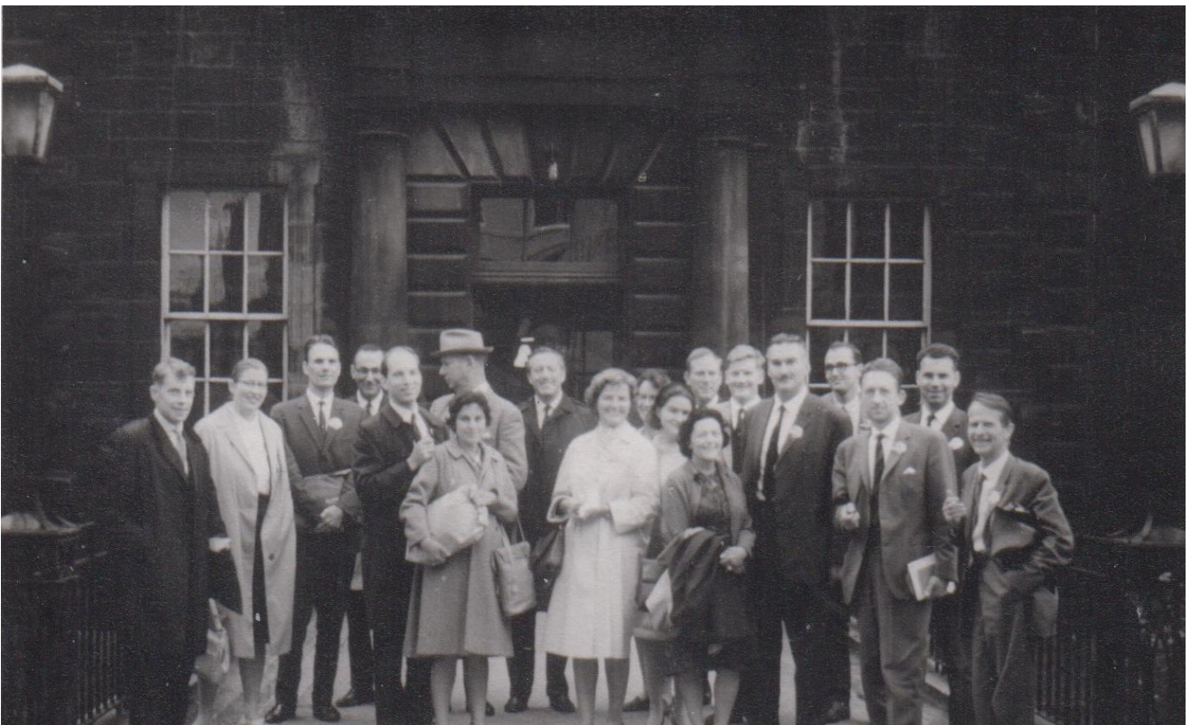
The foundation meeting of the International Association for Lichenology during the Botanical Congress in Edinburgh in 1964.

In lockdown during Corona, there was finally time to clean up. Between all my papers I found this letter with a photo from 1964. I also learned to meet online by participating in the International Symbiosis Conference. This new experience gave me the idea to share my vision of lichens and their place in biology with the younger generation of scientists.