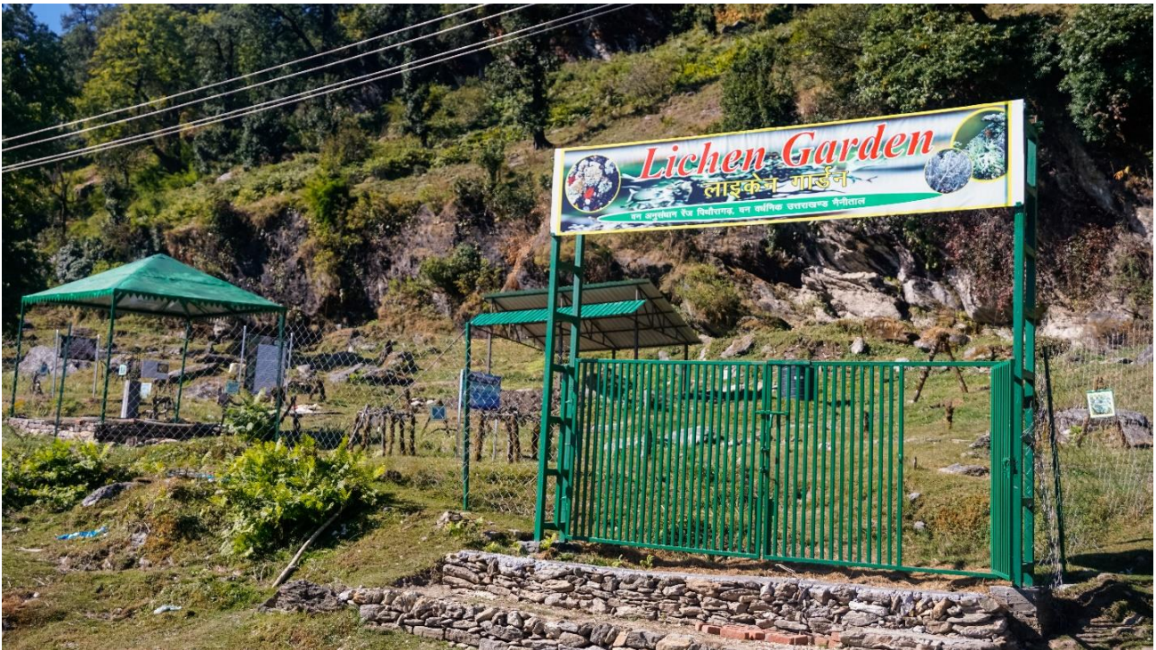
Entrance of the Lichen Garden at Munsiyari, India (Photo: Yogesh Chandra Tripathi).