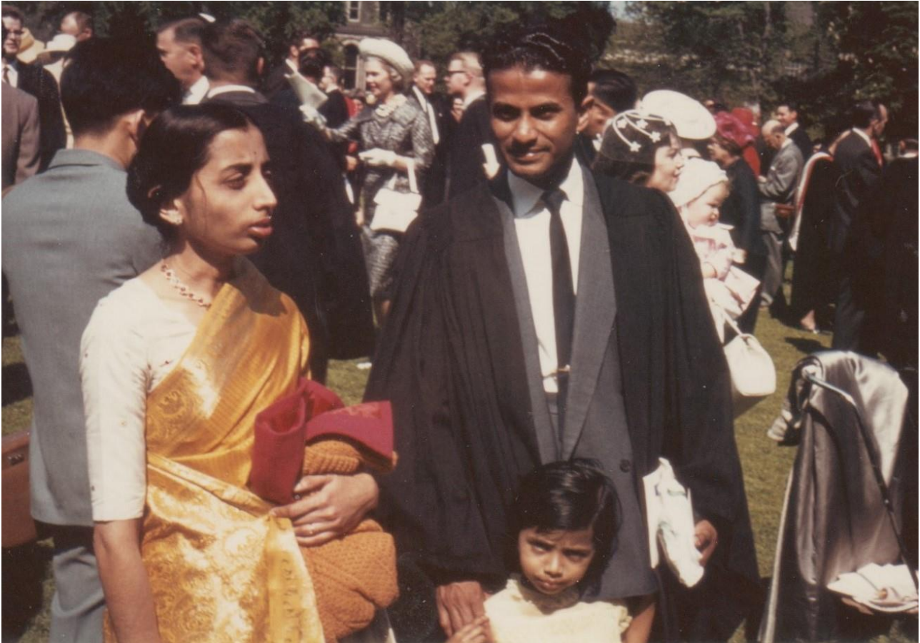
Who recognizes this mystery couple in the photo found together with this letter?