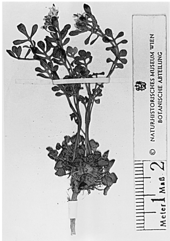
Figure 3. The epitype of Cardamine reseditolia L., W (Photograph by courtesy of the Museum of Natural History, Vienna, G. Oettel).

There are two references to illustrations in the protologue. The first of them is in Bauhin's Prodromus theatri botanici (Bauhin, 1620: 45). The plant depicted here seems to be C. reseditolia , however it lacks a very important identification character, namely auriculate bases to the leaves and thus could be misidentified with Cardamine glauca Spreng. Probably this was the source of the distributional information in Species plantarum , as Bauhin (1620: 45) wrote "... Helvetiorum alpiibus & Pyrenaeis". The other illustration which is referred to in the protologue is that of Boccone in his Museo di piante rare della Sicilia (Boccone, 1697: 51 [the correct page reference is 51 not 41 as printed in Species plantarum ]). The plant depicted here captioned as "Nasturtium alpinum, Rhesedae folio" most probably belongs to C. reseditolia , but the illustration is very poor and again lacking the auriculate leaf-bases. There is no herbarium specimen in Bauhin's herbarium in Basel (BAS) (Dr H. Schneider, pers. comm.) and