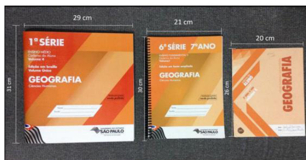
Image 1: Dimensions of the three versions of Caderno do Aluno. From left to right: braille version, enlarged version and regular version

The braille version is frequently divided in more than one book, since this technique uses a bigger space and the sheets of paper are thicker (Image 1). This model presents not only the text but also the pictures adapted to braille. Although Foundation Dorina Norwill can use the technology that allies braille to paint, the contract with the Government establishes that two different versions of books must be used.