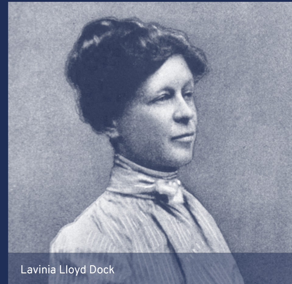
Lavinia Lloyd Dock

In 1947 she was honored for her achievements at the International Council of Nurses convention.