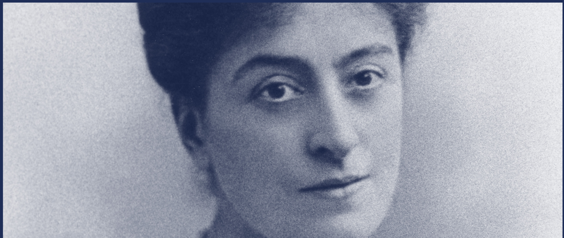
Ethel Gordon Fenwick