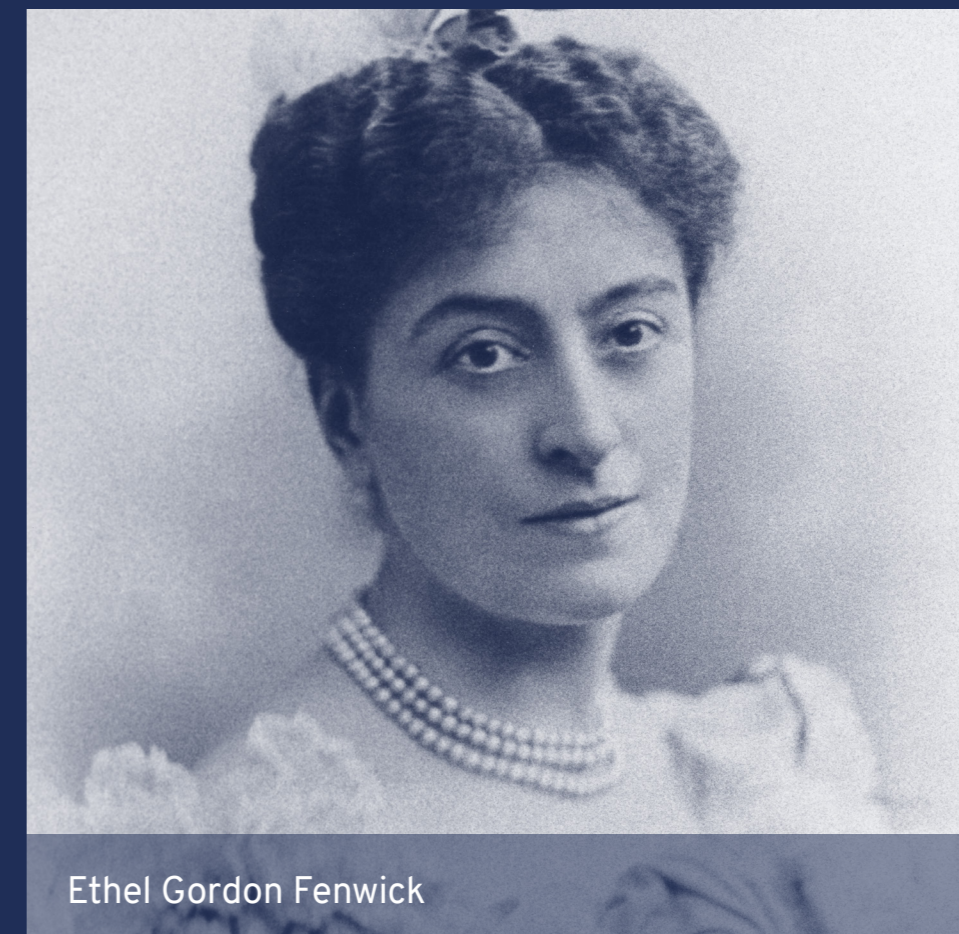
Ethel Gordon Fenwick