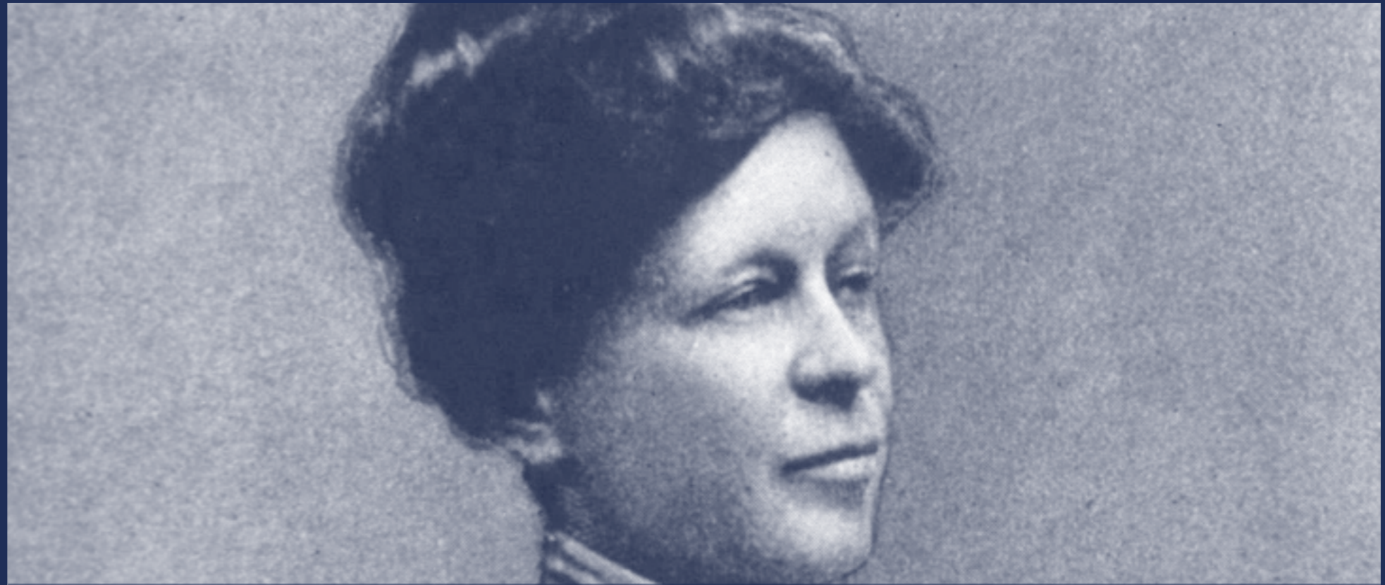
Lavinia Lloyd Dock