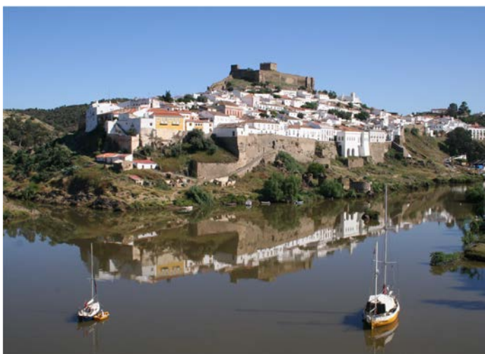
Figure 2 - Mértola and the Guadiana River.

Mértola is located in a transition region between the plain of Alentejo and the Serra do Algarve, a territory with a strong rural character, far from the country's major economic development centres. Currently, this small village has just over 1.000 inhabitants, and it is home to a vast territory, with about 2,279 km 2 sprinkled with small villages. However, for centuries, this village had a great importance as a commercial trading post, due to its location at the end of the navigation of the Guadiana River (fig. 1 & 2). It is located on a steep peninsula formed by the confluence of the Guadiana River and the Oeiras stream, with exceptional defensive conditions, which have made it an important urban nucleus since at least the Iron Age.