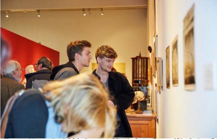
Figure 3 - Museum Dr. Guislain Gent, exposition 'Op losse schroeven' [On the Loose]