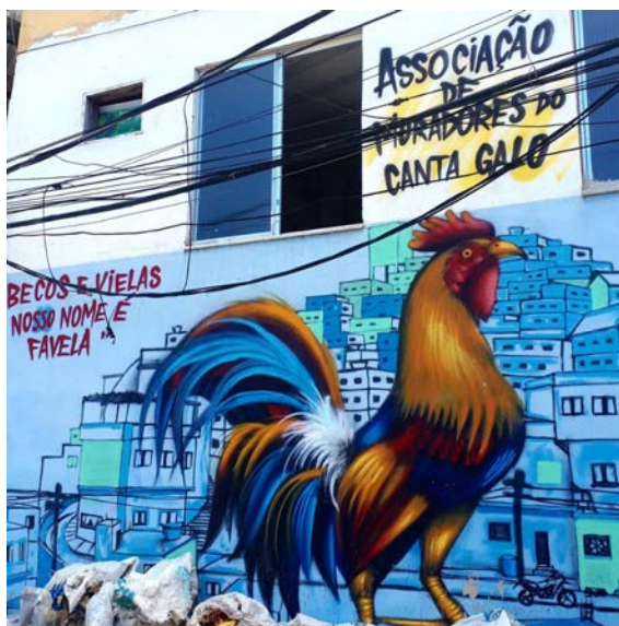
Figure 5 - Un lieu important, le siège de l'association des habitants de Cantagalo. Novembre 2021.

L'idée souvent invoquée de “resgatar a memória” (“sauvegarder la mémoire”) acquiert ici le sens de rendre visible, public, d'activer dans le présent ce qui était resté dissimulé jusqu'alors. Le caractère patrimonial du MUF ne se limite pas à la seule préservation des restes du passé : sa matière première est la culture de la favela. Et ce que la ville lui doit. Car il est une chose que l'on oublie parfois de rappeler : pour de nombreux habitants de Rio de Janeiro, les favelas du centre-ville seraient vouées à disparaître. Selon cette perception encore couramment partagée, l'idée d'y créer un musée ne peut que sembler incongrue. Il est dès lors plus facile de comprendre les enjeux de sa création à partir du point de vue inverse, à travers la volonté de valoriser des modes de vie, des dimensions culturelles et historiques négligées en raison de la ségrégation territoriale urbaine ; de renforcer l'estime de soi des habitants, et en favorisant une cohésion en leur sein, les capacités de ces acteurs locaux lorsqu'ils se trouvent aux prises avec des menaces d'expulsion, ou engagés dans des négociations sur le développement de leur territoire.