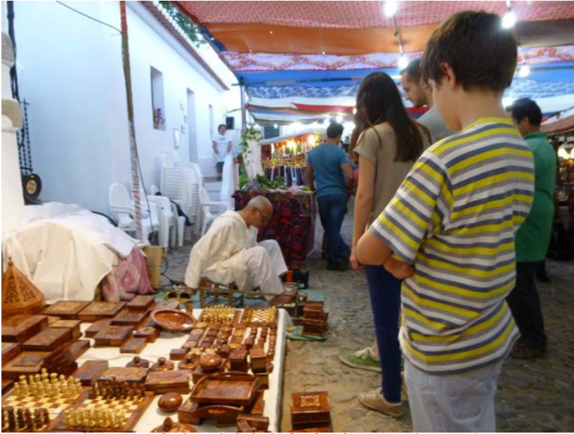
Figure 6 - 8 th Islamic Festival of Mértola.