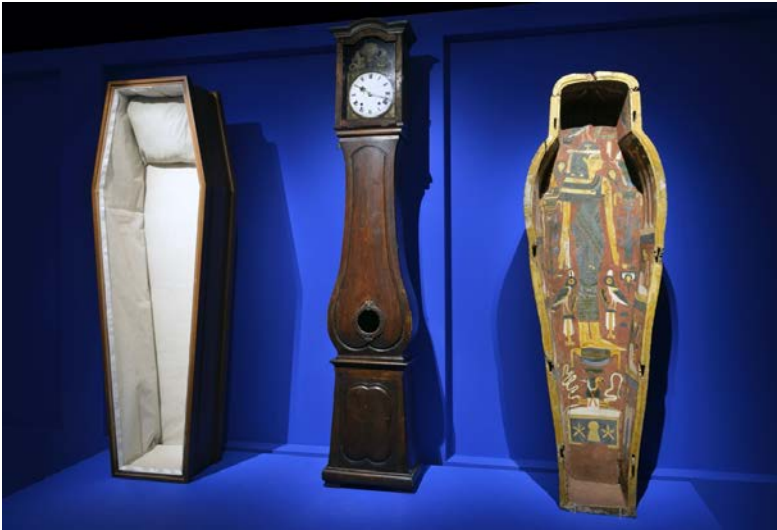
Figure 2- Un cercueil, un morbier et une cuve de sarcophage égyptien dans l'exposition "C'est pas la mort !", réalisée en 2015 par des étudiants en ethnologie et en muséologie de l'Université de Neuchâtel, en collaboration avec l'équipe du MEN.

Pour les premiers, ces travaux appliqués constituent une initiation par la pratique aux approches expographiques développées dans ce musée.