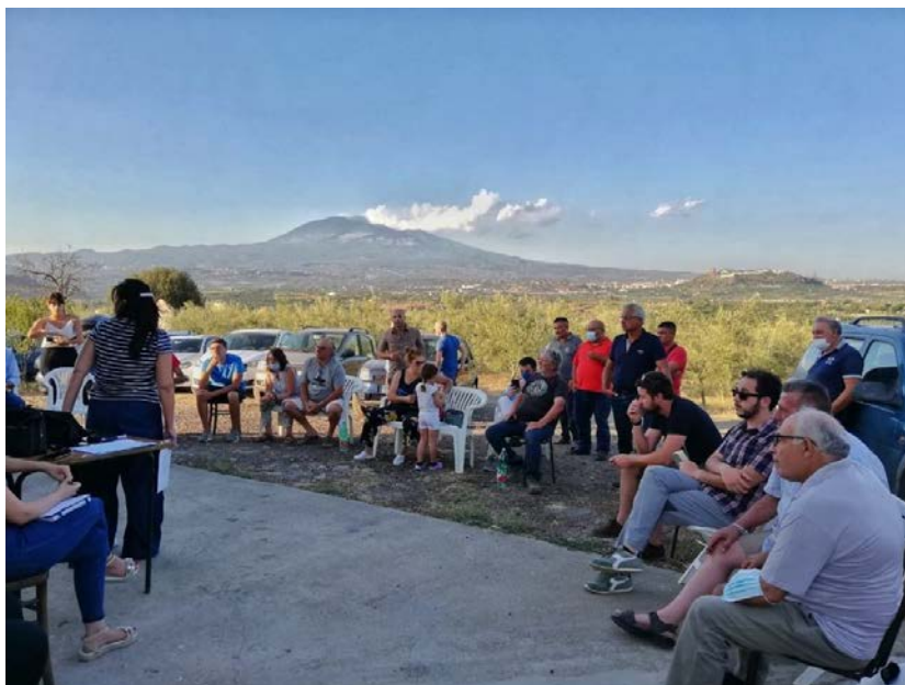
Figure 2: Public meeting with farmers and breeders of the Valley following the July fires, Simeto River Ecomuseum, Oasi Ponte Barca 2021.

Most of the itineraries — ecological and cultural corridors — designed as part of the ecomuseum were destroyed. However, the Ecomuseum Group did not stop working, and together with Presidium they have expressed solidarity with those who have seen their work and dreams destroyed by fires by means of various initiatives, including two notices to the Public Prosecutor's Office in Catania and Enna, public meetings with farmers and breeders, social and community networks, mutualism on a local and regional scale and various support and reorganization initiatives (see Figure 2)