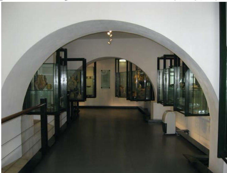
Figura 4 - Museum of Mértola – Islamic Art.