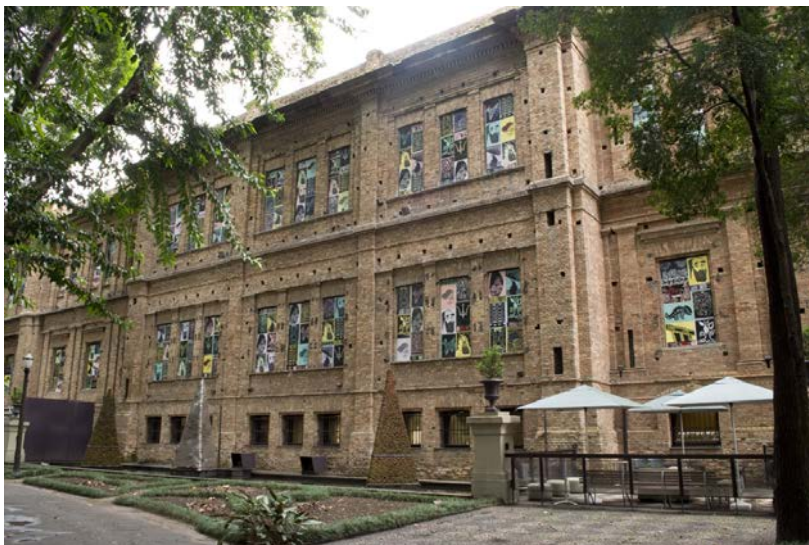
Figure 2 - Woodcut exhibition in Pinacoteca's windows.

while affording recognition and positive social visibility for persons experiencing homelessness, who are subjected to a series of social stigmas on a daily basis.