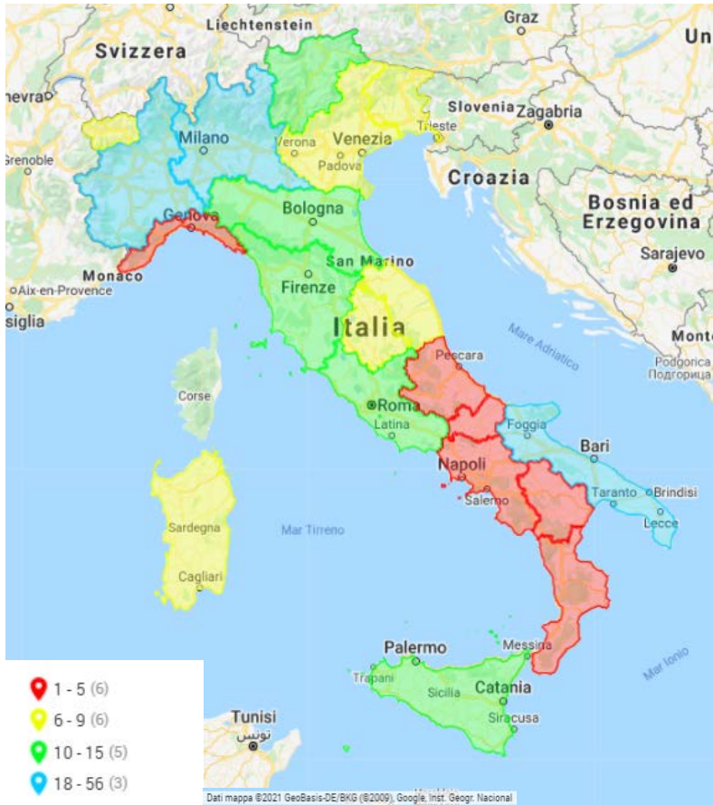
Figure 1 - Number of ecomuseums in each Italian Region in 2021