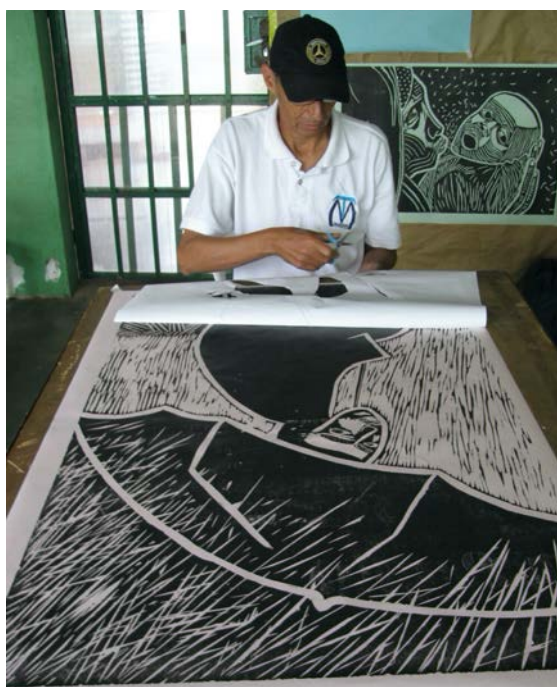
Figure 1 - Woodcut workshop.

dialogue with Pinacoteca's surroundings, since groups of people experiencing homelessness usually roam through the São Paulo downtown area. Our interest is in establishing closer and more productive relationships with these groups, given that we are geographically close although socially distant. We decided to hold art workshops upon realizing that there was almost no activity of this type on offer for this population. Finally, we chose graphic techniques due to our previous experience with these groups and our knowledge of some of their cultural repertoires involving the popular traditions of woodcut printing from Brazil's northeastern states, from where many of São Paulo's migrants come. Woodcutting also involves materials and procedures closely related to the everyday lives of those who have worked in construction or carpentry, for example.