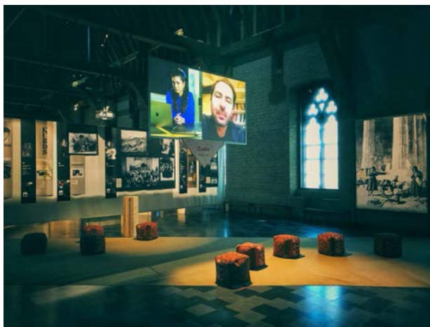
Figure 1 - In Flanders Fields Museum Ieper, exposition 2022 'Voor de Beschaving', de Eerste Wereldoorlog in het Midden-Oosten, 1914-1923 ['Before Civilisation': World War I in the Middle East, 1914-1923]