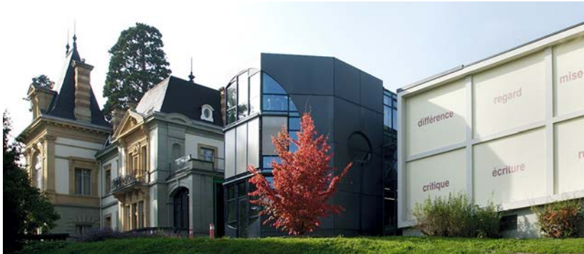
Figure 1- Le Musée d'ethnographie de Neuchâtel. À gauche, la Villa de Pury, siège du musée depuis 1904 ; à droite l'extension du "musée dynamique" (aujourd'hui appelée "blackbox") inaugurée en 1955. Au centre, le bâtiment de l'Institut universitaire d'ethnologie, construit en 1986 et comportant également une salle d'exposition temporaire.

De quoi donc est faite cette "rupture" ? L'intégration dans les collections des objets de notre quotidien, au sein d'un musée ordinairement consacré aux objets des "autres", n'en est qu'un aspect, et résumer en quelques paragraphes les multiples dimensions et implications de cette approche est une gageure. On se contentera ici de relever quelques aspects explicitement élaborés par Jacques Hainard au milieu des années 80, et revendiqués à divers titres au long des décennies suivantes.