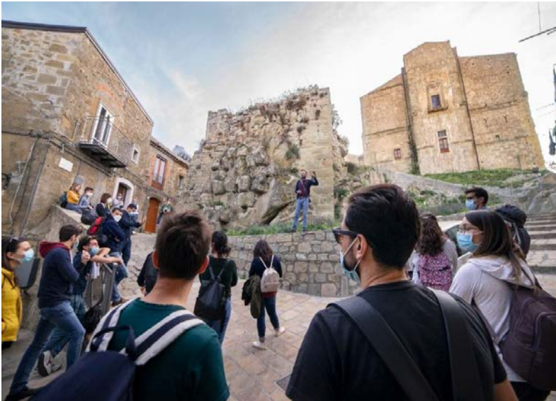
Figure 1: Mapping walk of Simeto's cultural heritage, Simeto Ecomuseum, Troina 2020.

aim is to stimulate a sense of shared responsibility in opposition to the commodification of local heritage and ecosystems, towards the activation of new economies capable of guaranteeing the quality of life for all and everyone, while respecting the Biosphere.