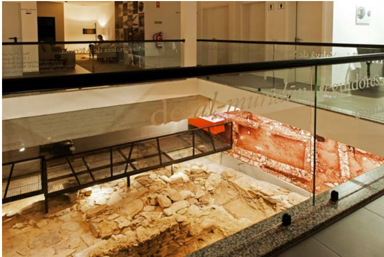
Figure 5 - Riverside Suburb. Photo of Câmara Municipal de Mértola