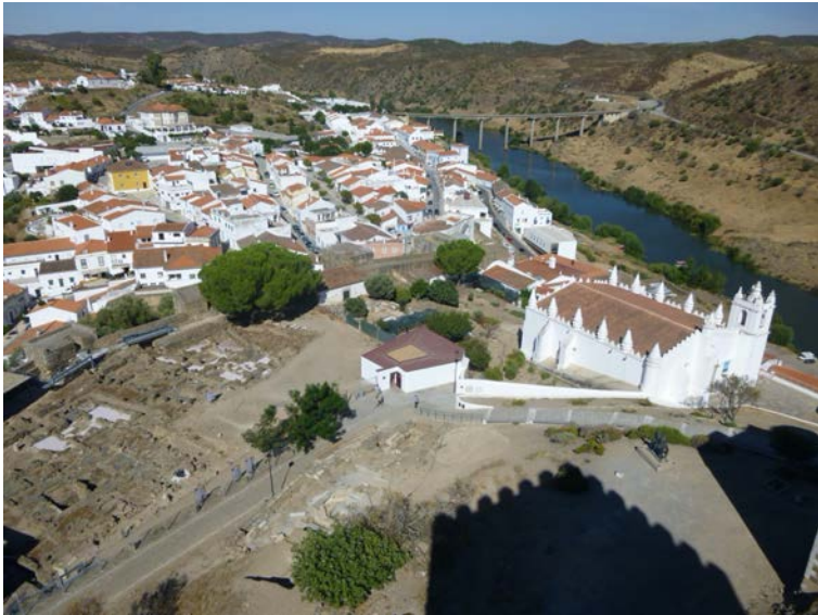
Figure 3 - Alcáçova and Parish Church/old Mosque seen from the Castle.