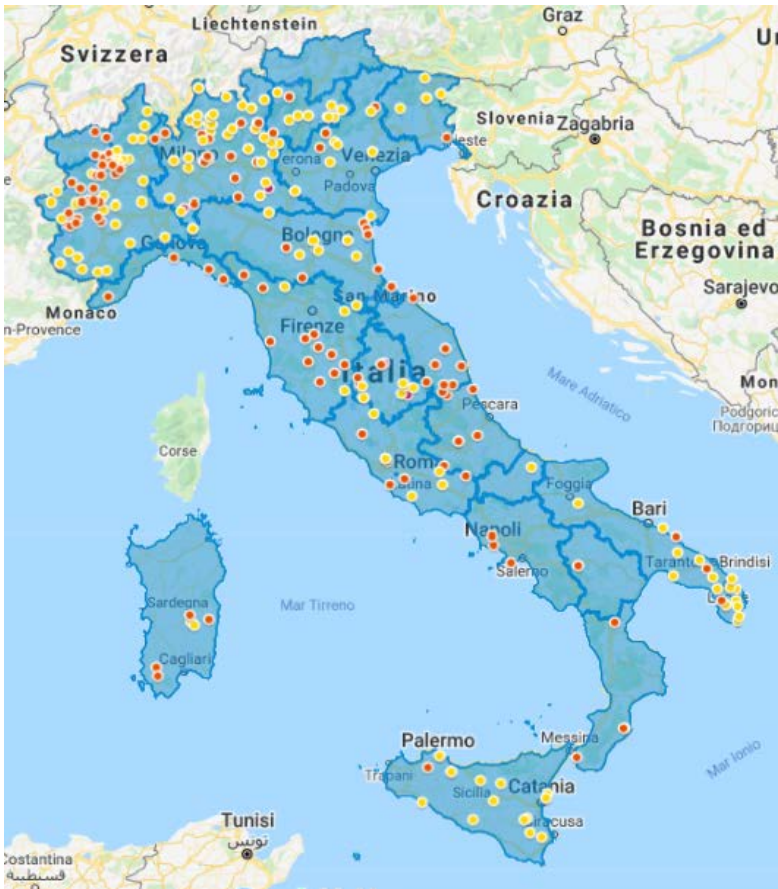
Figure 2 - Map of the Italian ecomuseums surveyed in 2021. In yellow the 141 ecomuseums that are recognized on the basis of regional laws, in red the 103 unrecognized ecomuseums.