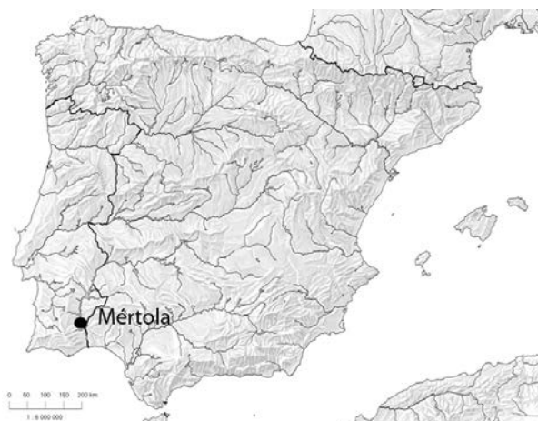
Figure 1 - The Location of Mértola.

At that time, its goals were not very different from what is now becoming the widespread philosophy in broad sectors of archaeology: to involve the local population with the aim of consolidating its identity and contributing to local development. However, what may seem an unquestionable programmatic postulate emerged in a concrete context and only took hold thanks to the persistence of a group of individual and collective agents who see themselves as part of the local population.