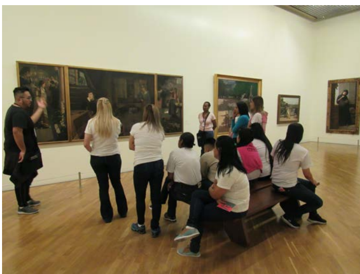
Figure 3 - Group's visit to the Pinacoteca.

The state's Penitentiary Department and its adult prison population came together into a collaborative partnership to undertake three different initiatives. First, in 2017, meetings held at the Department's headquarters with incarcerated men and women in semi-open prisons led to an exhibition of reproductions of works from the museum collection that this group reinterpreted based on their personal experiences in prison and outside. Then, in 2019, the Pinacoteca team held five workshops in a women's prison to encourage artistic experimentation and debate on identity issues and get court authorization for a group of 15 women to participate in an educational visit to Pinacoteca. For most of those prisoners, this would be their first visit to a museum ever.