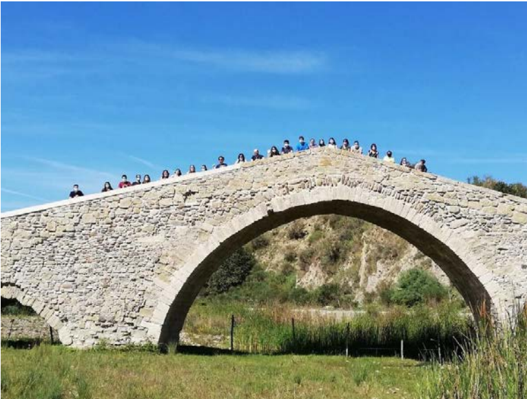
Figure 3: Mapping walk of the cultural heritage of Simeto. The bridge, symbol of the trajectory of change, Simeto Ecomuseum, Ponte Failla, Troina 2020. Photographic archive of the Participatory Presidium of the Simeto River Agreement, 2020.

In light of the experience gained, it emerges that the current institutional management systems present flaws or, at least, elements of ineffectiveness. In response, we have been trying for years to put in place an attempt to build a shared governance through the SRA and, in this context, by means of the Simeto Ecomuseum as a device for the enhancement and care of the Simeto Valley commons. Although in an incomplete and faulty manner, the SRA and the ecomuseum have already marked a trajectory of change (Figure 3).