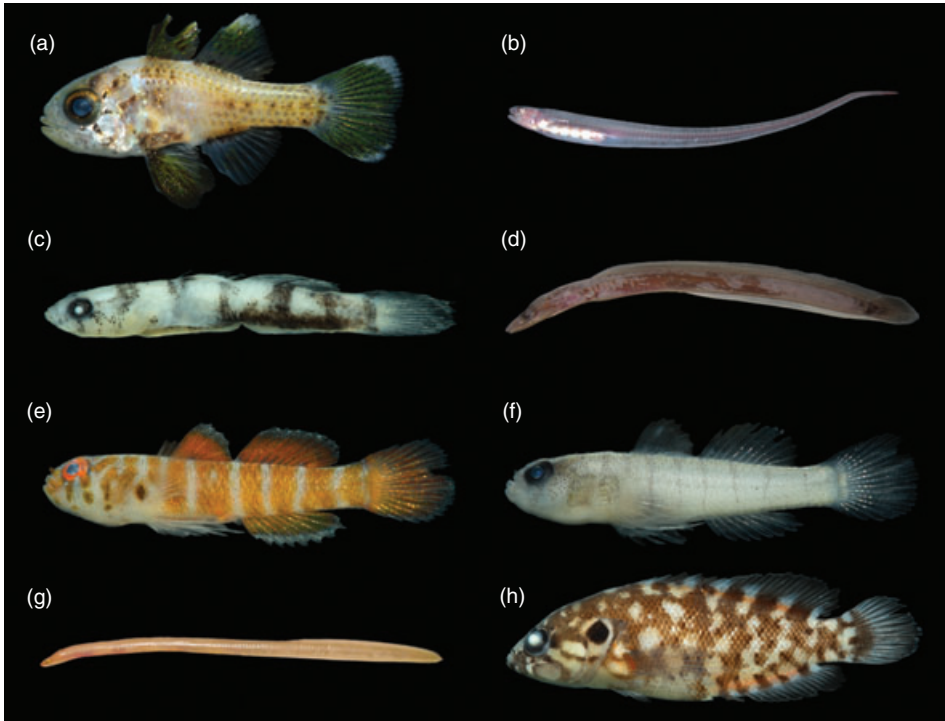
FIG. 1. Specimens photographed after fixation: (a) Astrapogon puncticulatus (CIUFES 1551; 26 mm total length, L_T ), (b) Carapus bermudensis (CIUFES 2114; 153 mm L_T ), (c) a juvenile Chriolepis fisheri (CIUFES 1568; 11 mm L_T ), (d) Kaupichthys hyoprорoides (CIUFES 2205; 60 mm L_T ), (e) Lythrypnus species 2 (CIUFES 1562; 14 mm L_T ), (f) an undescribed Lythrypnus sp. (CIUFES 2238; 14 mm L_T ), (g) Monopenchelys acuta (CIUFES 2204; 83 mm L_T ) and (h) Pseudogramma gregoryi (CIUFES 2203; 37 mm L_T ). Note that this specimen of K. hyoprорoides presents anomalous regeneration of the posterior portion of the tail.

seamount) by Andreata & Séret (1995). To date, no specimen of this species has been caught or sighted at either Trindade or Martin Vaz. The record of the conchfish Astrapogon stellatus (Cope 1867) cited in Pinheiro et al. (2009) is a misidentification of Astrapogon puncticulatus (Poey 1867). These specimens were re-examined and compared with another specimen collected in the present study [Fig. 1(a)]; all three individuals unambiguously belong to A. puncticulatus . It is likely that the visual record (R. L. Moura, pers. comm.) of A. stellatus in Pereira-Filho et al. (2011) also refers to A. puncticulatus . Thus, only A. puncticulatus is considered valid for Trindade Island.