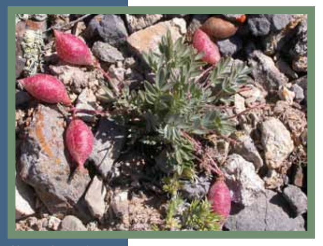
Above: Astragalus platytropis