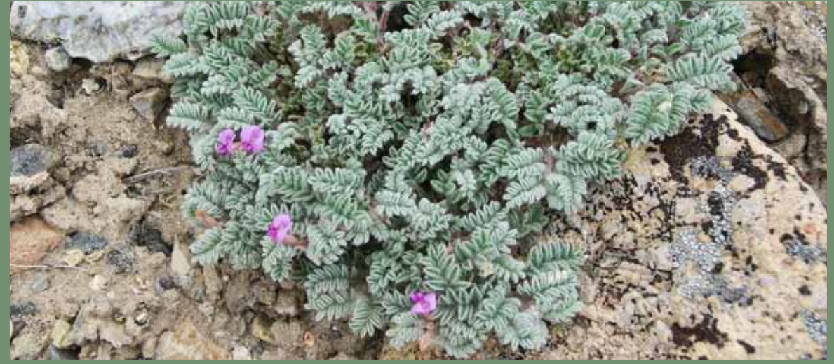
Right: Astragalus anserinus (Goose Creek milkvetch)

Astragalus can be an intimidating group to folks getting started in learning Idaho's wildflowers. Even though it may be difficult to identify some Astragalus species, it is not hard to appreciate the group's amazing diversity in Idaho, or marvel at their beauty and contribution to local landscapes. Come next spring, Astragalus will enliven many an open slope across Idaho. Enjoy them all!