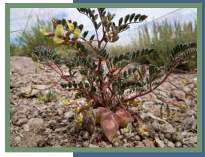
Below: Astragalus aquilonius

Below: Astragalus camptopus