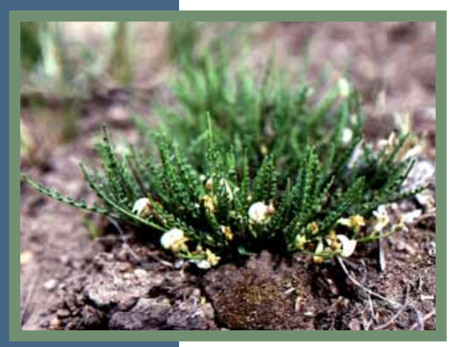
Above: Astragalus yoder-williamsii

Astragalus platytropis (Broad-keeled milkvetch): This diminutive, tufted species has silvery-gray foliage and whitish to lavender flowers. The swollen, reddish to mottled or speckled pods that lie on the ground are striking. Broadkeeled milkvetch occupies dry, rocky ridges and slopes, scree, and other rock outcrop habitats, most commonly on calcareous substrates. Populations in east-central Idaho and southwestern Montana are disjunct northward from the main swath of the species' ranges that includes parts of east-central California, Nevada, southeastern Oregon, and Utah. A high elevation mountain species across most of its range, broadkeeled milkvetch descends to the valley bottoms in eastcentral Idaho. You are usually enjoying a pretty view when you encounter this species in Idaho!