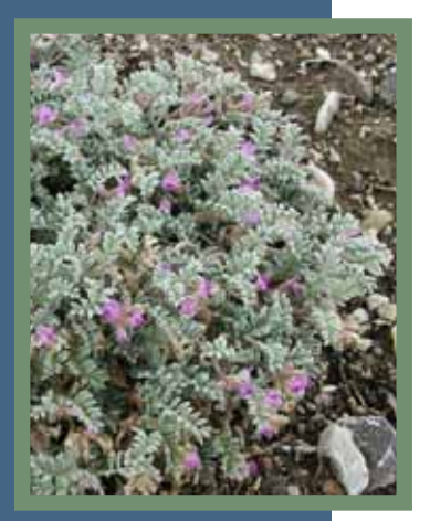
Above: Astragalus anserinus (Goose Creek milkvetch).