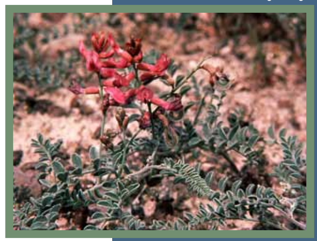
Below: Astragalus gilviflorus

Below: Astragalus camptopus