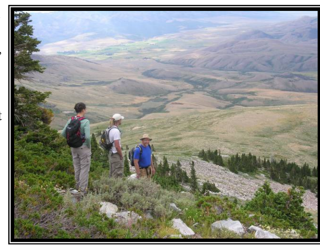
Foray participants on Mt. Harrison

Botanical enthusiasts assisted in making over 200 collections over the weekend. Permits allowed for the collection of 1 specimen per species in the Research Natural Area which was the first day's destination. Over one hundred plant species were found on this trip from the summit of Mt. Harrison down to the pool at the bottom of the cirque.