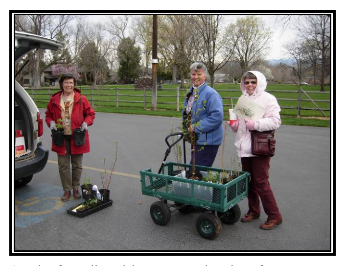
A recipe for smiles: pick up some native plants for your home landscape or garden. Want to make your friends smile – get them one too!

Pahove Chapter's 15<sup>th</sup> Annual Earth Day Native Plant Sale - Bright and early on the brisk morning of April 19<sup>th</sup>, about 30 Pahove Chapter volunteers gathered at the IDFG MK Nature Center to haul plants and set up the annual Earth Day Native Plant Sale. Though cold, windy conditions prevailed throughout the day, we had many eager shoppers and managed to sell most of the 3,000 plants on hand. Of particular note are the three ladies (pictured below) who drove all the way from Council to be first in line. And, they arrived nearly two hours early! Kudos to them and many thanks to all who came out to volunteer or purchase plants. And many thanks to the great folks at the Nature Center who so generously allow us to use their site and donate a tremendous amount of effort to this event. We were pleased again this year to donate a share of our profit to them.