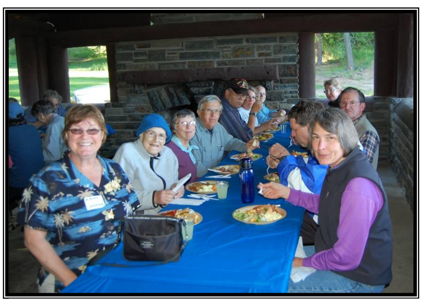
INPS members and guests share the catered 2010 Annual Meeting dinner at Chatcolet Shelter