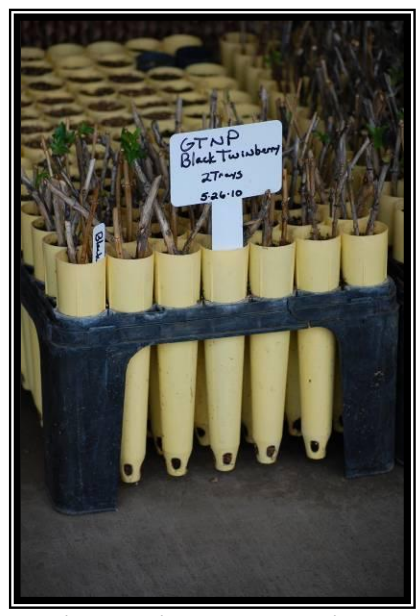
Native seedlings developed in the Plants of the Wild nursery for a restoration project

Wandering outside into the intense Palouse sunlight, we noticed hundreds of more mature native shrubs and trees flourishing in crowded rows of large pots.