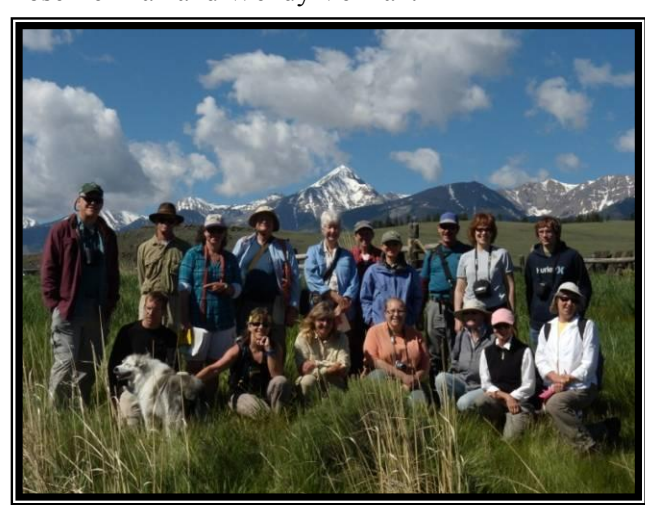
Upper Snake Chapter members on a June field trip to the foothills of the Lemhi Mountains.

June 26, 2010 – Birch Creek Valley/Foothills of the Lemhi Mountains. A sunny day brought out the enthusiasts to check out marsh plants by the creek and completely different plants on the dry hillsides a few feet away. Among many others, we found 3 species of vagrant lichen and blue-eyed grass. It was interesting to check out the Charcoal Kilns and learn about the history of the area. Many thanks to leaders Rose Lehman and Wendy Velman.