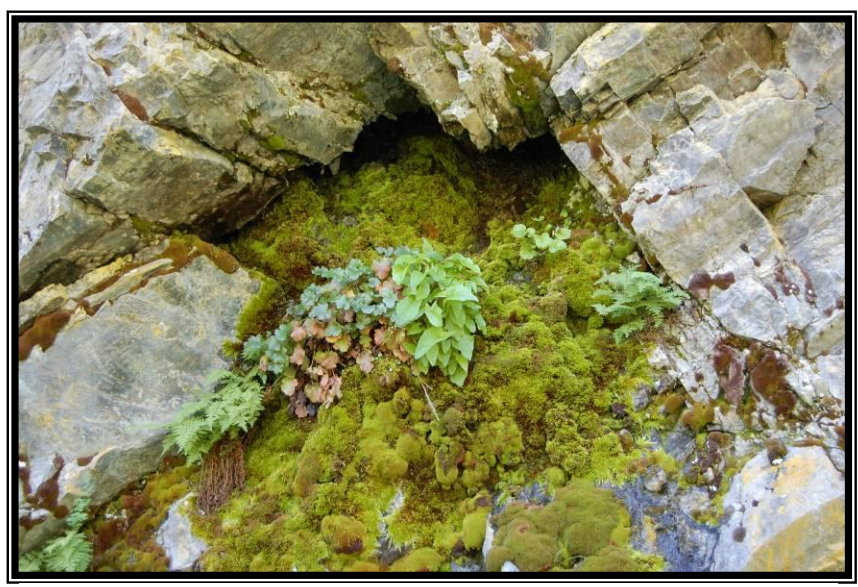
A profusion of coastal disjunct species in rocky Big Creek terraces

In the overstory of the unusually cool, lush forests around Big Creek, we noticed disjunct species western redcedar ( Thuja plicata ) and western hemlock ( Tsuga heterophylla ), along with Douglas-fir ( Pseudotsuga menziesii ), grand fir ( Abies grandis ), and western white pine ( Pinus monticola ) throughout this inland refugium. The diverse shrub layer contained oceanspray ( Holodiscus discolor ), Rocky Mountain maple ( Acer glabrum ), red-osier dogwood ( Cornus sericea ), Scouler's willow ( Salix scouleriana ), and Prunus emarginata var. mollis , the disjunct tree variety of bittercherry. Bracken, lady, and sword ferns ( Pteridium aquilinum , Athyrium filix-femina , and Polystichum munitum ) and abundant mosses filled the understories of the gentle slopes and stream terraces. Closer to the earth, broadleaf starflowers ( Trientalis latifolia ), clustered lady's slippers ( Cypripedium fasciculatum ), white shooting stars ( Dodecatheon dentatum ), and the rare Constance's bittercress ( Cardamine constancei ) bloomed later than usual, after the cool, wet spring.