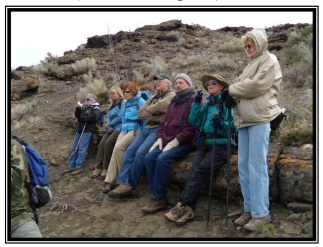
Upper Snake Chapter members bundled up for a spring hike around North Menan Butte.

April 24, 2010 – Earth Day at Tautphaus Park. Volunteers at the booth kept busy helping children and adults plant seeds in the biodegradable pots that we had made at our previous meeting. We gave out seeds for seven native species including Indian rice grass ( Achnatherum hymenoides ) and arrowleaf balsamroot ( Balsamorhiza sagittata ), and discussed