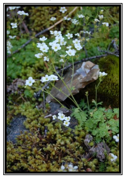
Saxifrage blooming in the damp cliffs over Big Creek

Some big changes that have happened since I took office in 2009 have impacted the Society. Our Sage Notes editor moved (Thanks Dylan for the continued support). We hosted the first Native Flora Workshop, we lost a chapter, and added a new chapter.