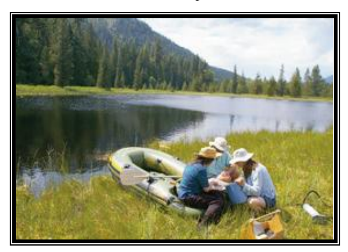
Class members picking invertebrates from samples collected along mat edge.

A fixed sphagnum mat occurs north of the lake. It is characterized by intermediate fen vegetation. Dominant vascular species were slender sedge ( Carex lasiocarpa ), and dulichium ( Dulichium arundinaceum ). Bursik found two rare species in this community: inundated clubmoss ( Lycopodiella innundata ) and St. John's wort ( Hypericum majus ), a very small, low growing plant not seen. Lycopodiella is now considered a common species.