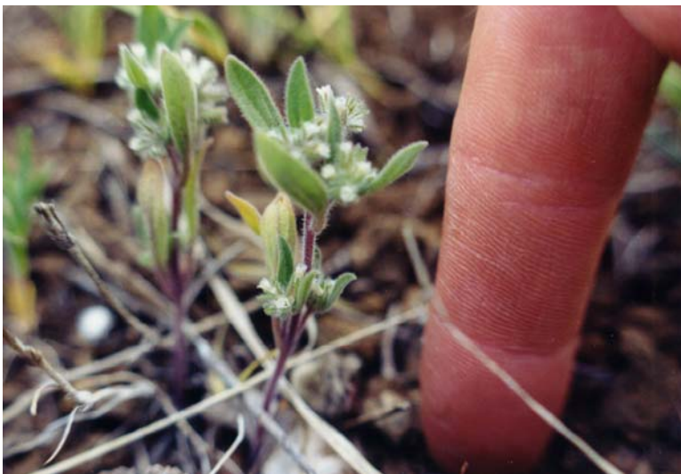
Figure 1. Photos of Phacelia inconspicua taken at North of Sunset Cone (005) on June 9, 2001.

Photos and line drawings: See prior status reports (Moseley 1989, Holland 1996), Mozingo and Williams (1980), Cronquist (1984), Nevada Natural Heritage Program (2001), and Popovich (2001) for illustrations and photos of Phacelia inconspicua . Figure 1 includes photos of Phacelia inconspicua .