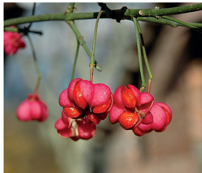
Fleshy orange fruit ripening inside the four-valved red capsule.

the current populations appear stable 1,17-19 . This species can be a host of other diseases, such as a strain of cucumber mosaic virus, strawberry latent ringspot and in some countries, a strain of cherry leaf roll virus 1 . Despite its toxicity, scales and aphids can adapt to survive its otherwise 'insecticidal' chemistry 1,10,17-19 .