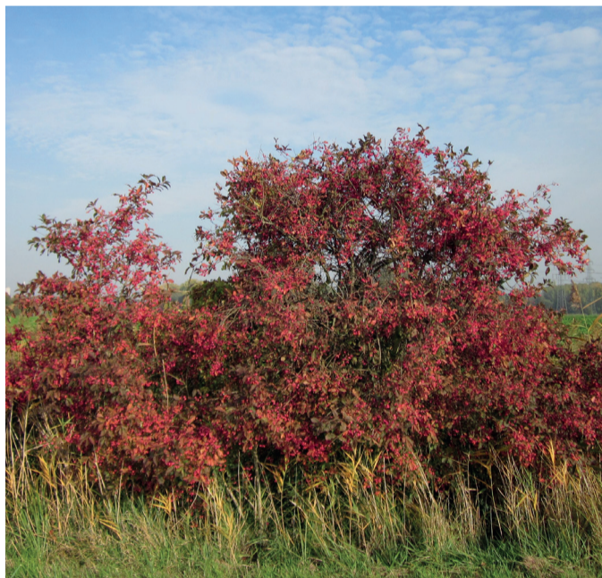
Shrub form of spindle in late autumn in a rural area along the Upper Rhine valley (Hockenheim, South-West Germany).

There are no serious threats for this species 1 . The spindle tree is the primary overwintering host of the black bean aphid ( Aphis fabae ) which feeds on field beans ( Vicia faba ) and sugar beet ( Beta vulgaris ) and the peach potato aphid/green peach aphid ( Myzus persicae ), a widespread pest of a large number of crops 1,17-19 . As a measure against black bean aphid, in the past spindle trees have been removed from hedges and woodlands (e.g. England), although