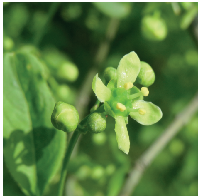
Blossoming hermaphrodite flower with 4 green petals, sepals and 4 yellow stamens.

the current populations appear stable 1,17-19 . This species can be a host of other diseases, such as a strain of cucumber mosaic virus, strawberry latent ringspot and in some countries, a strain of cherry leaf roll virus 1 . Despite its toxicity, scales and aphids can adapt to survive its otherwise 'insecticidal' chemistry 1,10,17-19 .