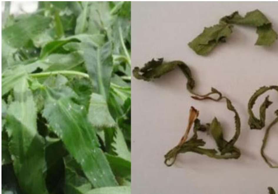
Fig 2 Falcario vulgaris , fresh leaves (left), dried leaves (right)

http://www.discoverlife.org/mp/20p?see=L_MWS108791&res=640