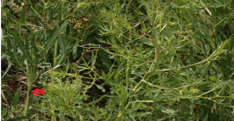
Fig 1 Falcario vulgaris , leaf (White arrow), stem (Red arrow) and size