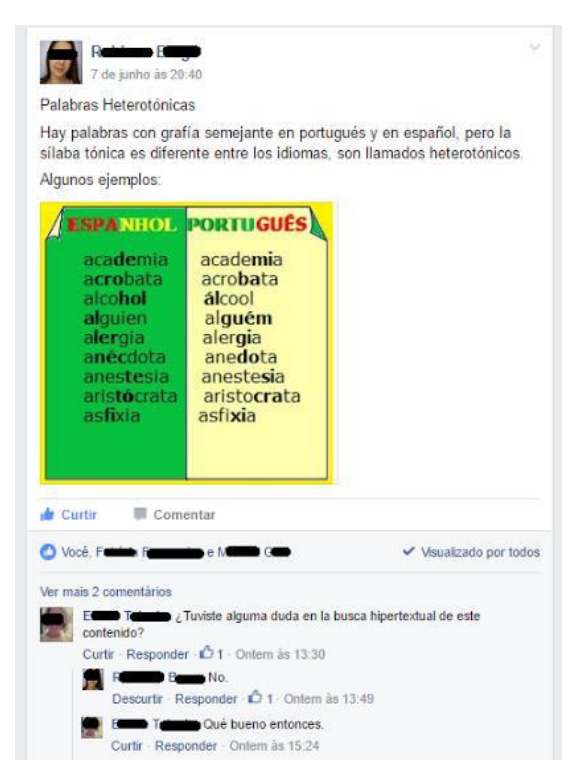
Fig.2: Written production and teacher interference

Thus, we could observe that the hypertextual readings in the digital context favored the practice of authorial writing and allowed the students to increase the capacity to choose the information researched and then produce their texts according to the proposition of the activity,