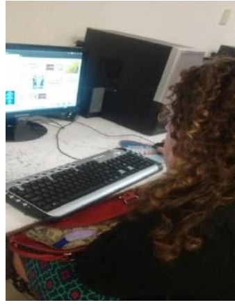
Photograph 1: Student during the hypertextual research

The second step was the written production by the students, happened after the readings. It was possible to note what Lévy (1996, p. 43) defends about hypertextual devices: they work as "[...] a kind of objectification, exteriorization, virtualization of reading processes" because it allows the reader to select, schematize, integrate "[...] words and images to a personal memory in permanent reconstruction" (Fettermann, Silva & Paula, 2016, p. 4). This can be observed in the figures below: