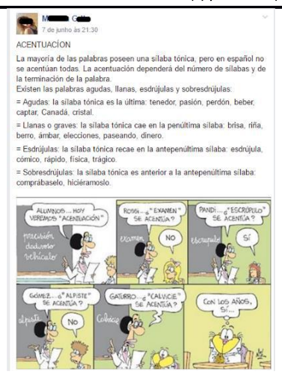
Fig.1: Written production

The following figure demonstrates teacher mediation in virtual space. We emphasize, however, that it happened throughout the teaching and learning process of the themes worked, from classes outside the computer lab until after the postings, through the teacher's interactions with the students using the Spanish language to explain the new content, clarification of the doubts, suggestion of the work and tutoring of all the activity in the group of the class on Facebook.