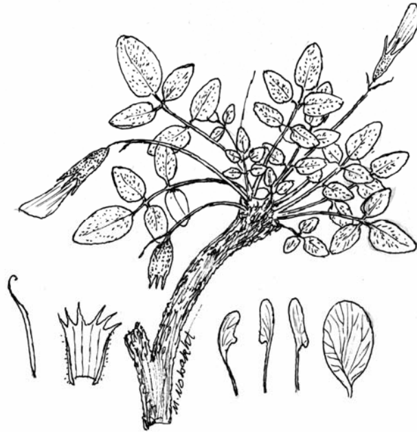
Fig. 2. Astragalus kalatehensis (natural size).

stipules and petioles. Stipules 10 mm long, triangular, adnate to the petiole for 5 mm, densely white hairy. Leaves 4 cm long; petiole 1.5 cm long, ca. 1 mm thick, rather densely white hairy. Basal leaves unifoliolate. Leaflets 2-3 pairs, ovate to elliptic, rounded at the base, acute to more rarely rounded at the apex, 5-14 mm long and 3-8.5 mm wide, loosely to rather densely hairy on both sides, often spotted with minute dark reddish dots. Peduncle 1 cm long, up to 0.4 mm thick, densely hairy. Raceme 2 flowered. Bracts narrowly ovate, acute, 2 mm long, covered with white hairs. Pediceles 2 mm long, flowers erect to spreading. Bracteoles filiform, ca. 3 mm long, at the base of calyx, permanent. Calyx 13 mm long, tubular, slightly gibbous at the base, obliquely cut at the mouth, loosely to densely covered with asymmetrically white medifixed hairs mixed with black ones; teeth subulate, 4 mm long,