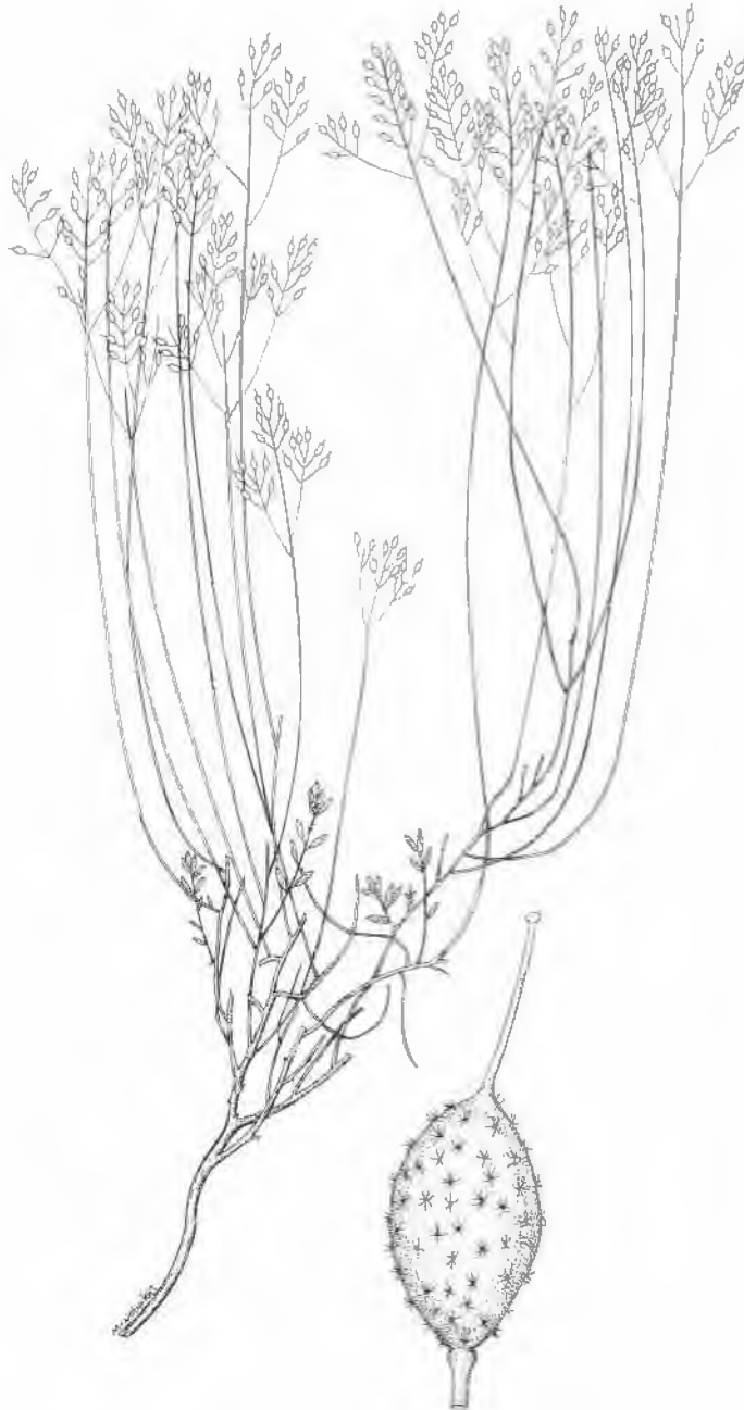
Fig. 1. Alyssum mozaffarianii ( \times 0.6 ); fruit ( \times 11 )