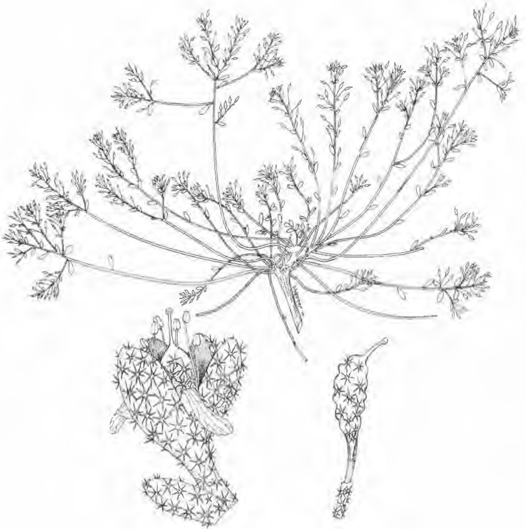
Fig. 2. Alyssum stipitatum ( \times 0.7 ); flower ( \times 28 ); fruit ( \times 7 ).