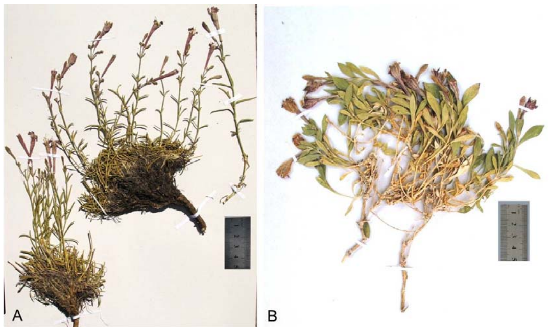
Fig. 3. Herbarium specimens of species studied. A, Silene mishudaghensis (Parsa Khanghah SPNH-2445); B, S. araratica (Gholipour SPNH-322, Scale bar = 5 cm).