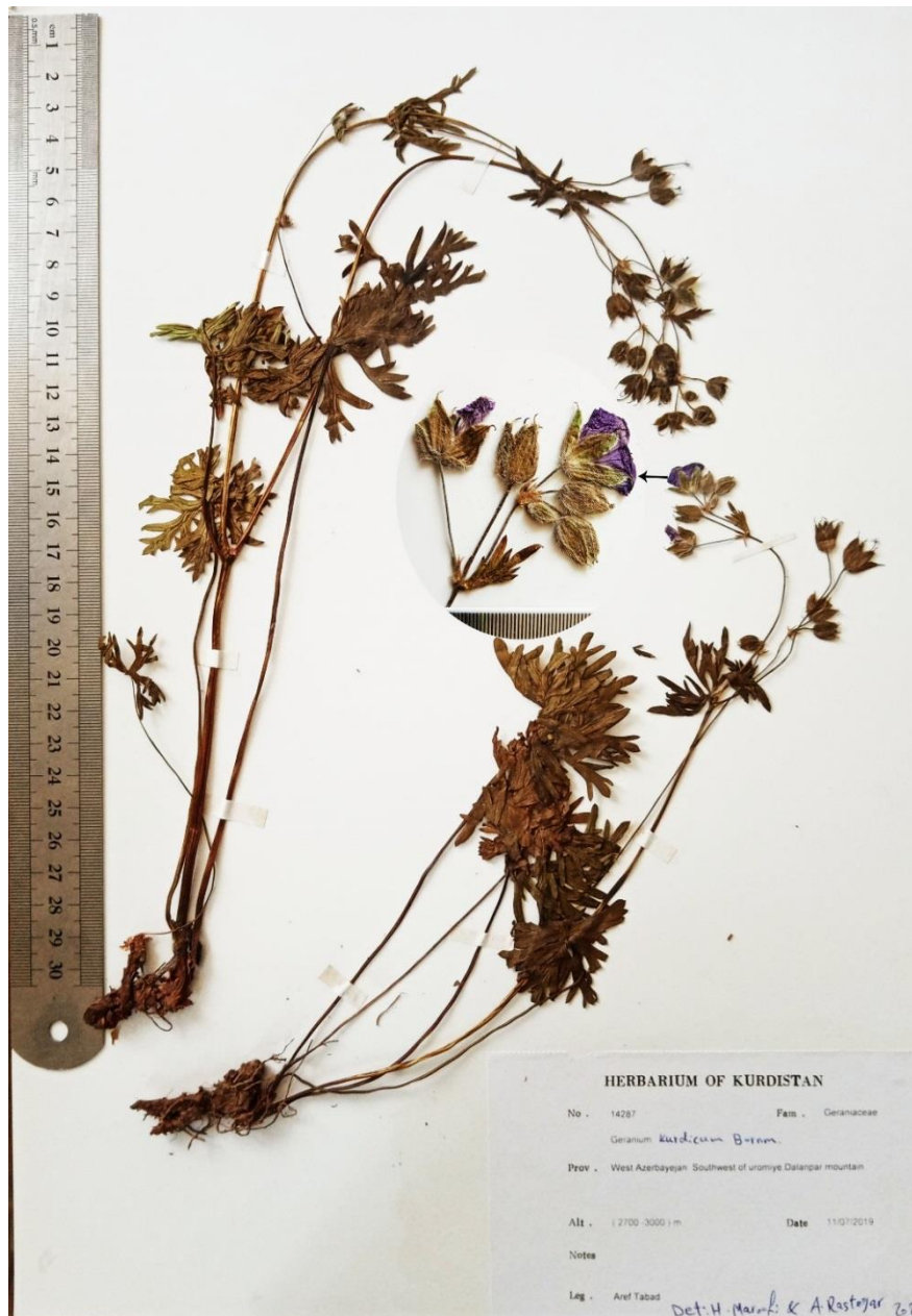
Fig. 1. Image of herbarium specimen of Geranium kurdicum Bornm.

Perennial, glabrescent, 18-37 cm; rhizome horizontal. Stems sparsely puberulent in upper parts. Basal leaves green on both sides, glabrous above, 4-7 cm diam., deeply palmatisect; segments cuneate-rhombic, very deeply pinnatisect into linear-lanceolate laciniae. Bracts 3.5-4.5 mm. Pedicels puberulent, eglandular. Sepals 7-9 mm, both puberulent and pilose, eglandular; awn 1.5-2.5 mm. Petals obcordate, 11-13 mm, lavender-blue or sometimes dark violet. Mericarps pilose.