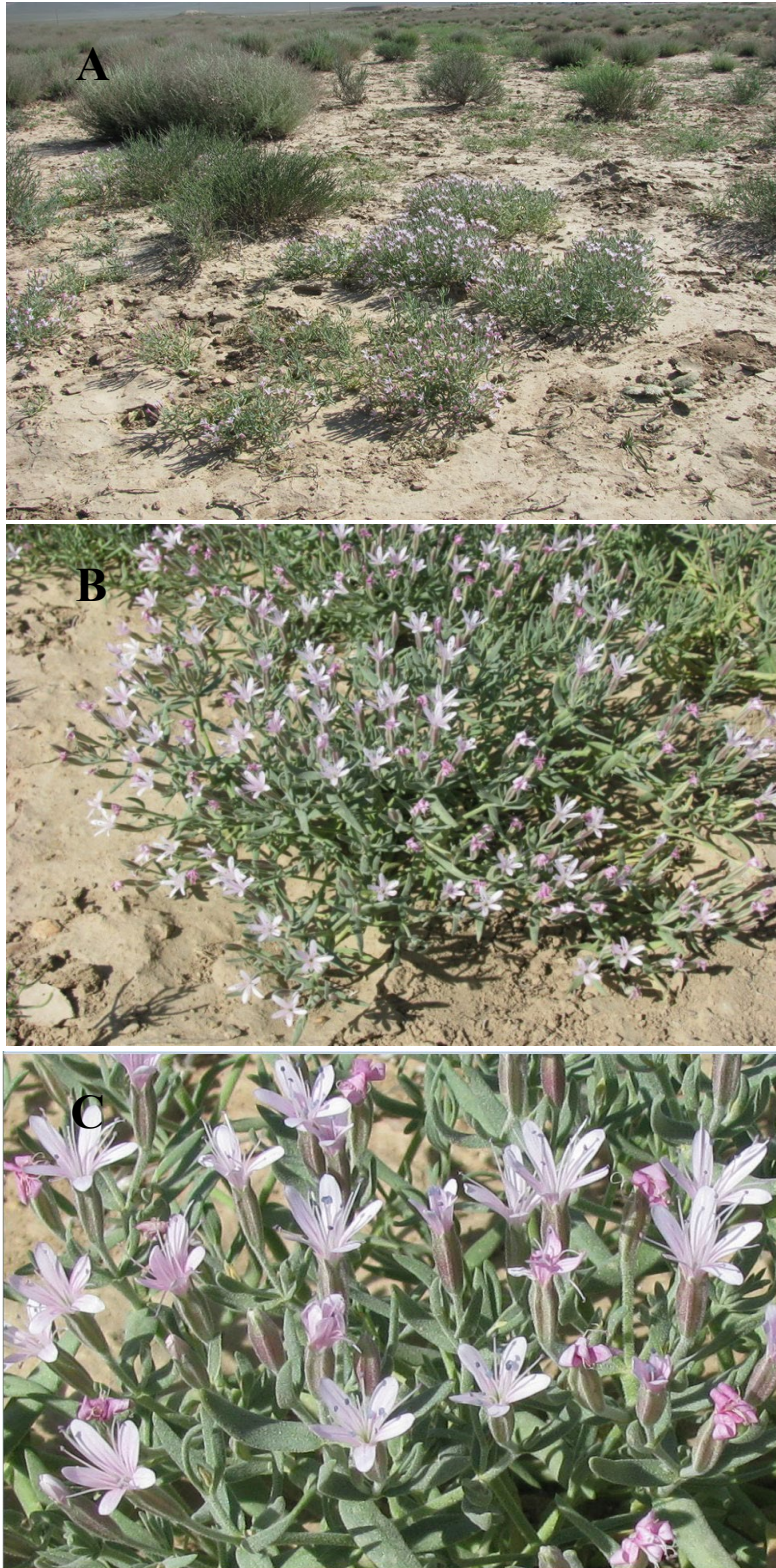
Fig. 2. A & B, Diaphanoptera gharehbilensis in its natural habitat in Robot-e-Gharehbil; C, a close-up image.