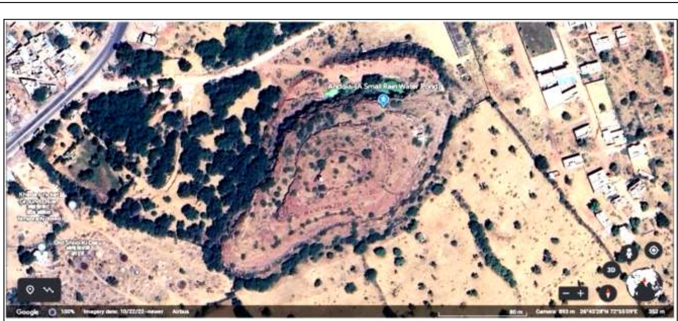
Fig. 1.New collection site of Striga gesnerioides var. minor : Andolai Hill (A small rain water pond) near Kabootaro ka Chauk Osian-Jodhpur, Rajasthan. Latitude and Longitude are 26°43′28″ N and 72°55′09″ E.

Habit (Fig.2): Both the varieties are clearly distinguishable from one another on the basis of height, color of plant and host specificity. The type var. gesnerioides has dark magenta color all over and 20-50 cm tall and characteristically found on roots of Euphorbia caducifolia Haines, although according to Saldanha (1963)<sup>[12]</sup> it's also reported on Lepidagathis & Dysophylla sp. but I have always found type var. on Euphorbia caducifolia while var. minor has green or reddish-green all over and 6-15 cm tall and found on roots of Lepidagathis trinervis Nees (first report on new host) or Lepidagathis bandraensis Blatter. The Branching pattern was used as a key character by Shetty & Singh (1991) <sup>[6]</sup> to distinguish both the varieties. According to them the type variety has much branched stem while the var. minor have un-branched stem, similar description was given by Bhandari M.M. (1990) <sup>[11]</sup>. In my observation I have always found branching in both the variety. Branching may occur from the base which often buried in soil due to the attachment on host root (Fig. 2 C) and not seen until unless digging out the plant, hence looks un-branched. Secondly branching may occur at the middle of stem in both varieties which can easily be seen (Fig. 2 A& B).