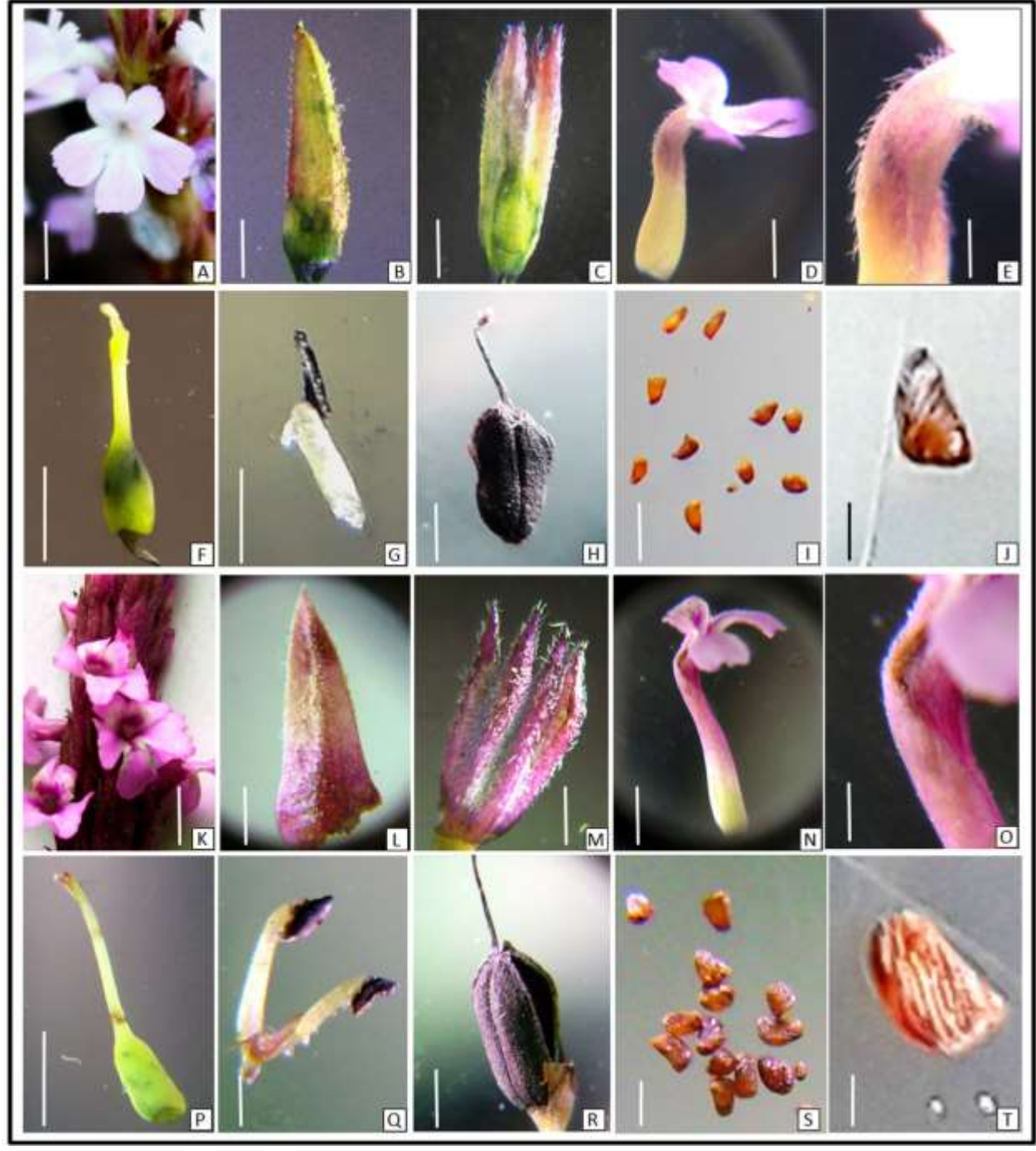
Fig. 3. Floral Characters (A-J) Striga gesnerioides (Willd.) Vatke var. minor & (K-T) Striga gesnerioides (Willd.) Vatke var. gesnerioides: A & K Open flower front view-Note difference in color; B & L Separated Bracts; C & M Calyx; D & N Corolla, E & O Enlarged view of distal end of corolla tube-Note presence and absence of retrorse hairs; F & P Gynoecium; G & Q Androecium; H & R Dried capsule-Note presence of persistent style; I & S seeds, J & T Seeds in enlarge view-Note presence of wavy grooves and ridges. All photos are at 10x magnification accept A & K. [Bars = 0.5 mm in I,G,Q,S; 1 mm in E,O; 1.5 mm in B,C; 2 mm in A,F,H,P,R; 3 mm in D,L,M,N; 4 mm in K]