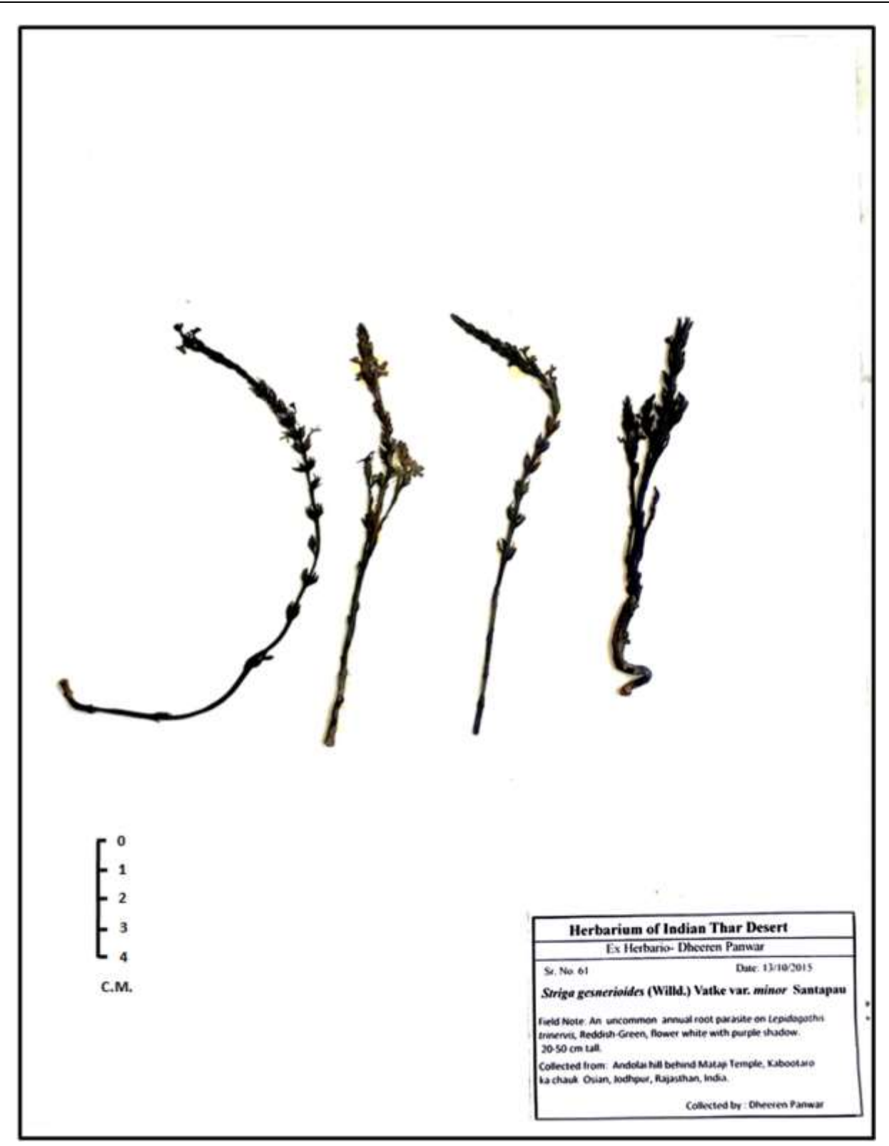
Fig. 4. Herbarium sheet of Striga gesnerioides (Willd.) Vatke var. minor -Freshly collected from new site Andolai Hill behind Mataji Temple kabootaro ka chauk Osian, Jodhpur, Rajasthan, India dated 13/10/2015.