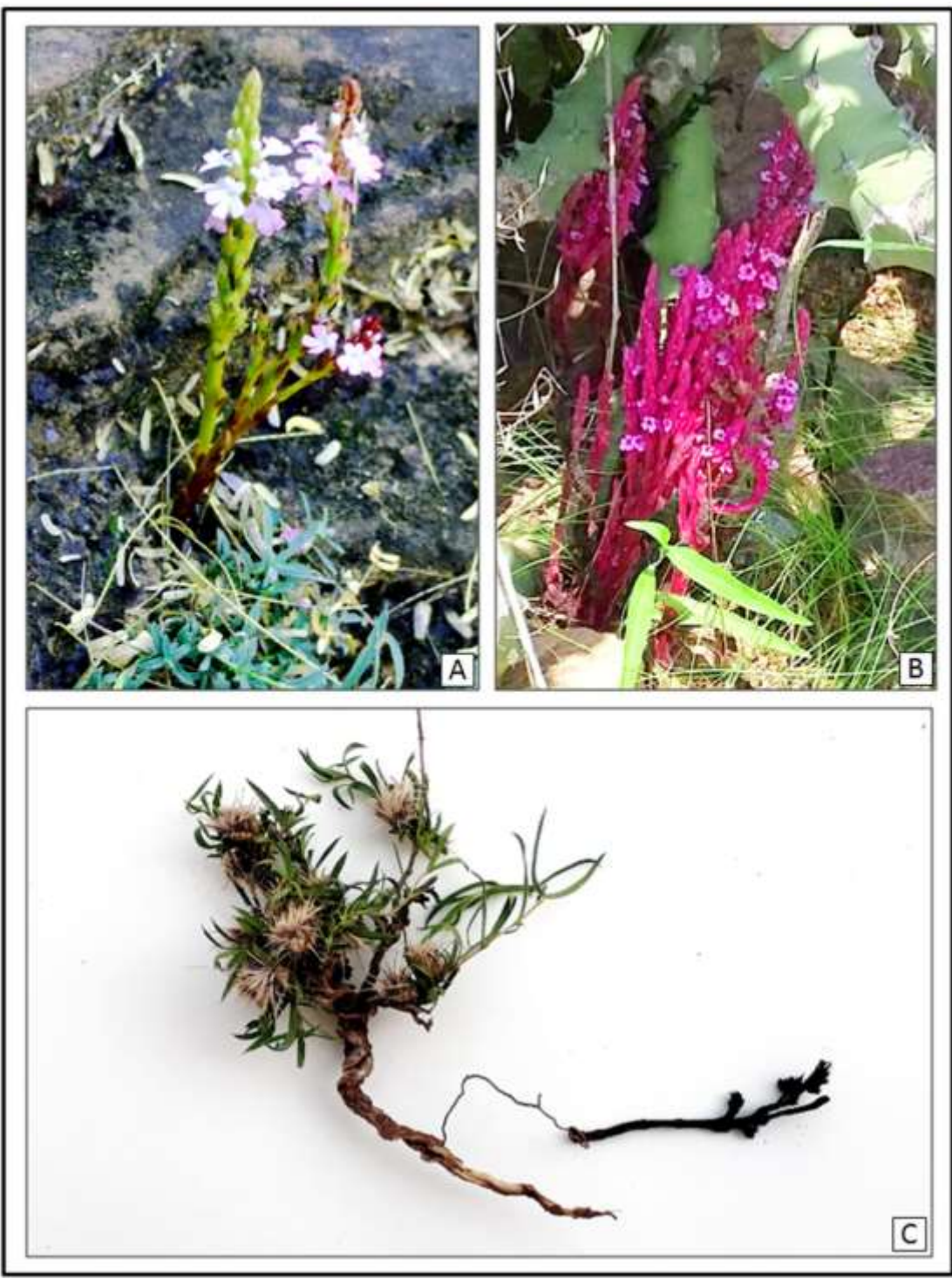
Fig. 2. Habit and Morphology : (A) Striga gesnerioides (Willd.) Vatke var. minor Santapau arise on Lepidagathis trinervis Nees; (B) Striga gesnerioides (Willd.) Vatke var. gesnerioides arise on Euphorbia caducifolia Haines; [Note- branching in both A & B]; (C) Attachment of var. minor on root of Lepidagathis trinervis Nees [Often attached to lateral roots which are spread in cracks of rocks hence looks separate from host]