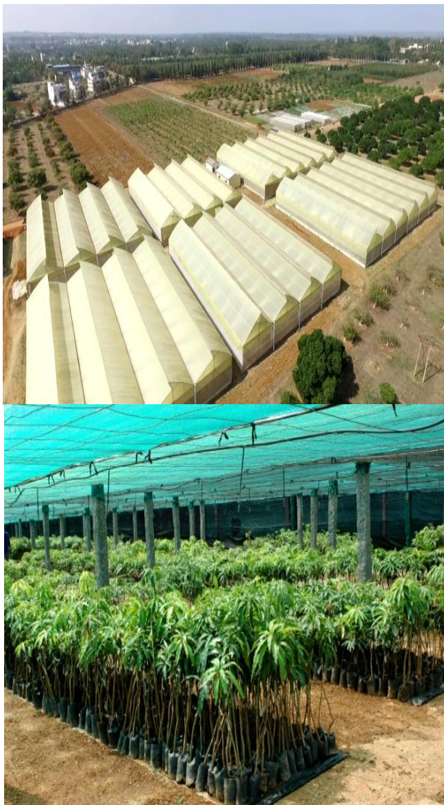
Figure 2. ICAR-IIHR Green house in Field Gene Bank

of desirable interstocks is implemented to develop these species and genetically characterized as a part of divergence studies within genic collection at ICAR-IIHR, Bengaluru.