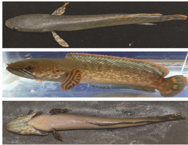
Fig. 1 Channa amari ZSIF7926, 111.5 mm SL; India: West Bengal, Alipurduar district, Bhalka forest, A. dorsal, B. lateral and C.ventral views of live specimen