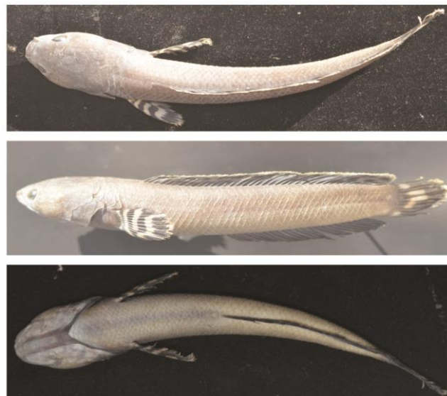
Fig. 2 Channa amari , ZSIF7926, 111.5 mm SL; India: West Bengal, Alipurduar district, Bhalka forest, A. dorsal, B. lateral and C.ventral views of alcohol preserve specimen