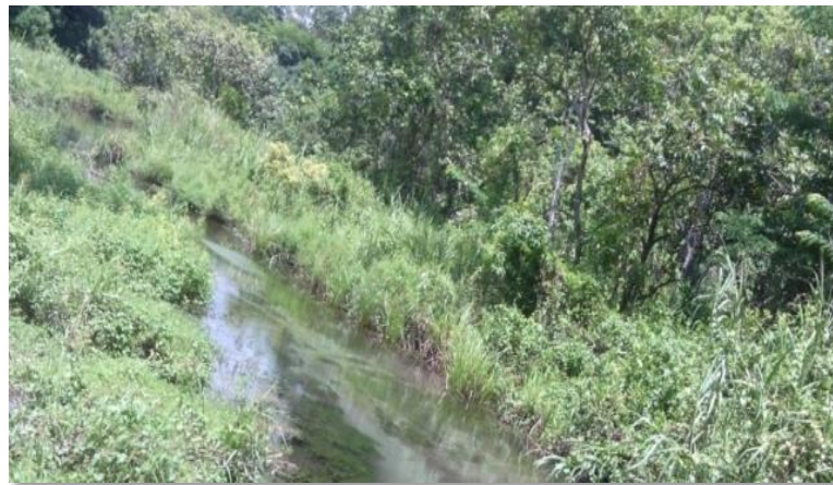
Fig. 4: Type locality of Channa amari , at Bhalka forest, Alipurduar district, West Bengal, India