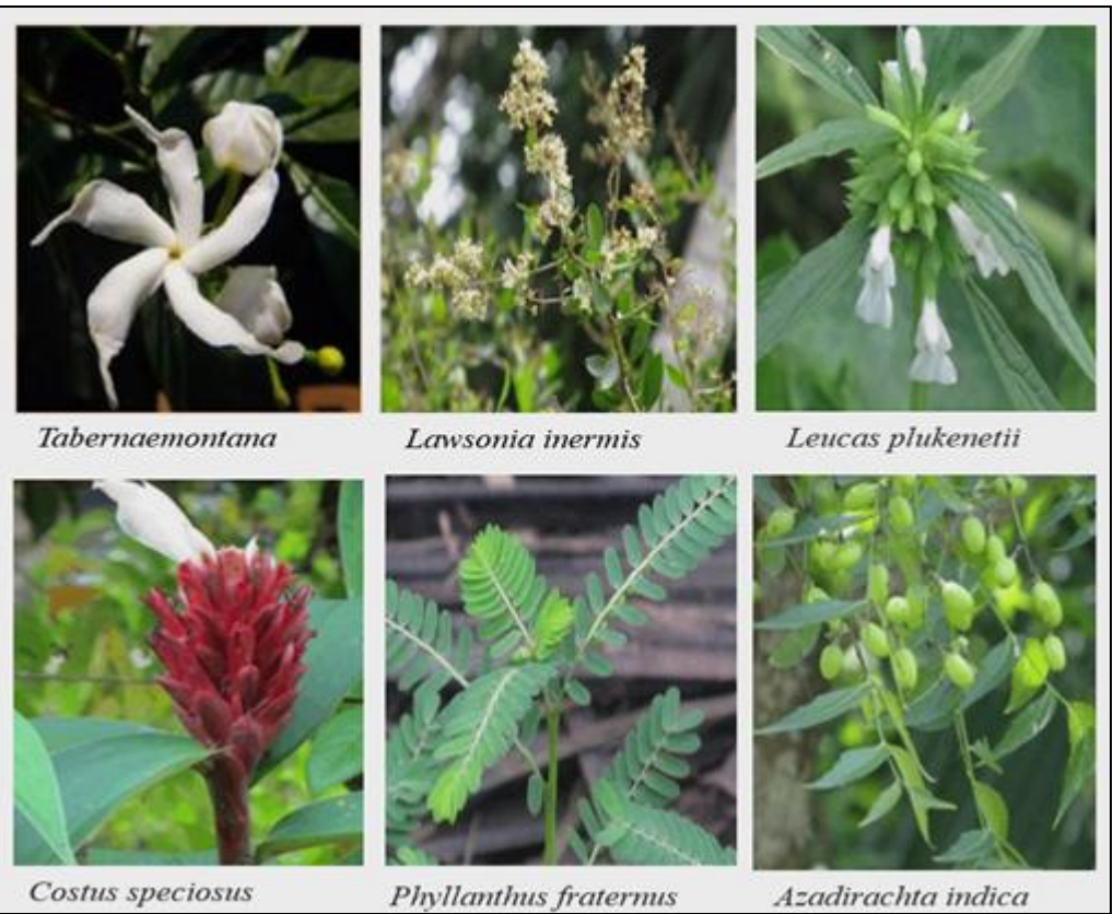
FIG. 2: COMMONLY USED MEDICINAL PLANTS WITH HEPATOPROTECTIVE PROPERTIES IN NORTH EAST INDIA <sup>35</sup>

Many plants and mixtures have been suggested to have hepatoprotective properties Fig. 2 . Beginning with Ayurveda medicine and expanding to the North East and other traditional medical systems, natural liver disease treatments have a long history. In order to support clinical efficacy, the strengths of traditional medical systems have been carefully combined with the contemporary ideas of evidencebased medical evaluation, standardization, and randomized placebo-controlled clinical trials,