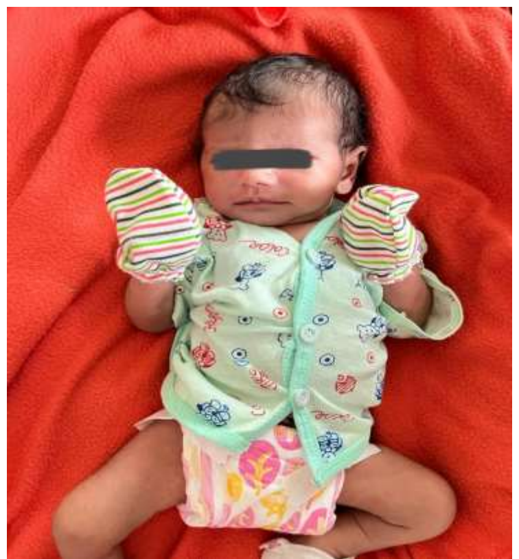
Fig 1: Neonate with c/o Xanthinuria

extensive areas of diffusion restriction involving bilateral cerebral hemispheres, bilateral corticospinal tracts and corpus callosum suggestive of Acute hypoxic ischaemic encephalopathy. On day 8 of life, baby was given expressed breast milk through orogastric tube. Oromotor stimulation was started. Oral feeds were established followed by breastfeeding. Baby shifted to motherside. Limb was physiotherapy was given. USG abdomen & pelvis was done which was normal. ENT opinion was taken in view of stridor. Flexible endoscopy revealed Laryngomalacia grade 2. Eye examination was done which showed temporal avascular retina. Baby had no further episodes of convulsions. Antiepileptics were tapered. Single anticonvulsant with maintenance dose was continued. Multivitamins Pyridoxine and containing other supplements were given. Parents were counselled about the condition and no purine diet was advised. Baby was discharged and advised for follow up at neurophysician.