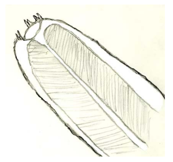
Fig. 3: Lips with pointed teeth and oesophageal inlet drawings using a Nikon microscope drawing attachment