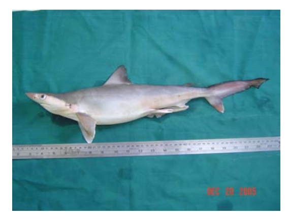
Fig. 1: Carcharhinus macloti , a small shark with a long snout and moderately large first dorsal fin

double papillae in dorsal lip and one double papillae in dorsoventral lip (Fig. 5), absence of interlabia, an undivided and muscular oesophagus with spherical ventriculus and