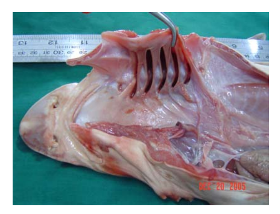
Fig. 2: Dissected shark was examined for parasites