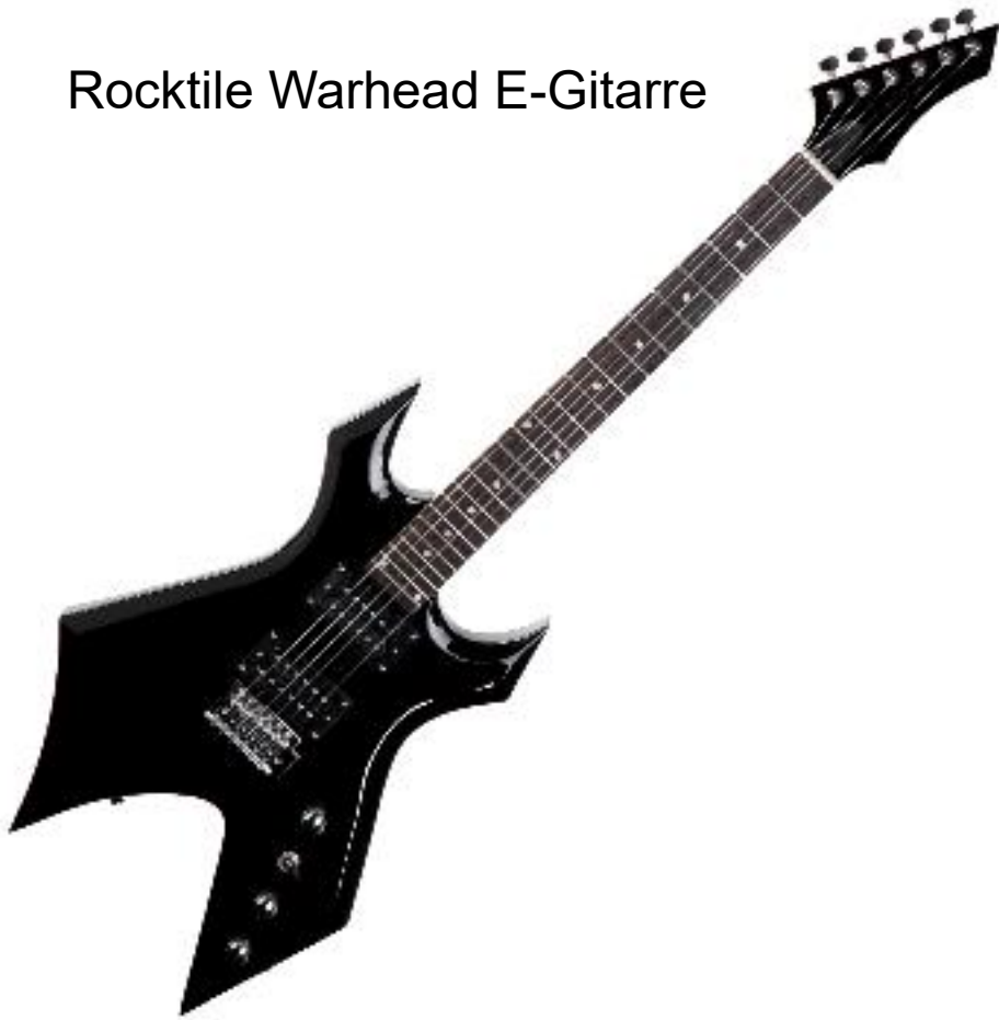
Rocktile Warhead E-Gitarre