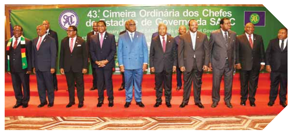
SADC Heads of State focused on sustainable industrialisation of the region.