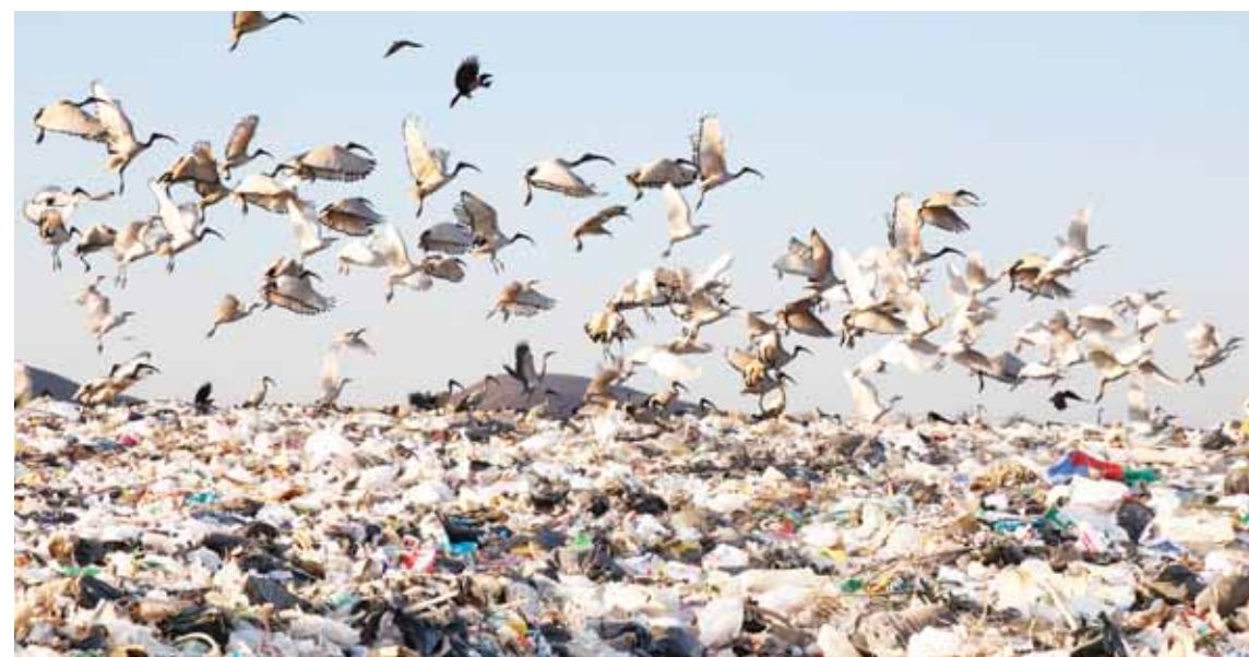
Gamodubu Landfill has brought along various detrimental effects to the village. These include issues such as stray dogs preying on residents' livestock, presence of dangerous birds, flies infesting the area, contaminated water seeping from the landfill, and occasional fires causing smoke, potentially posing health risks to the residents.