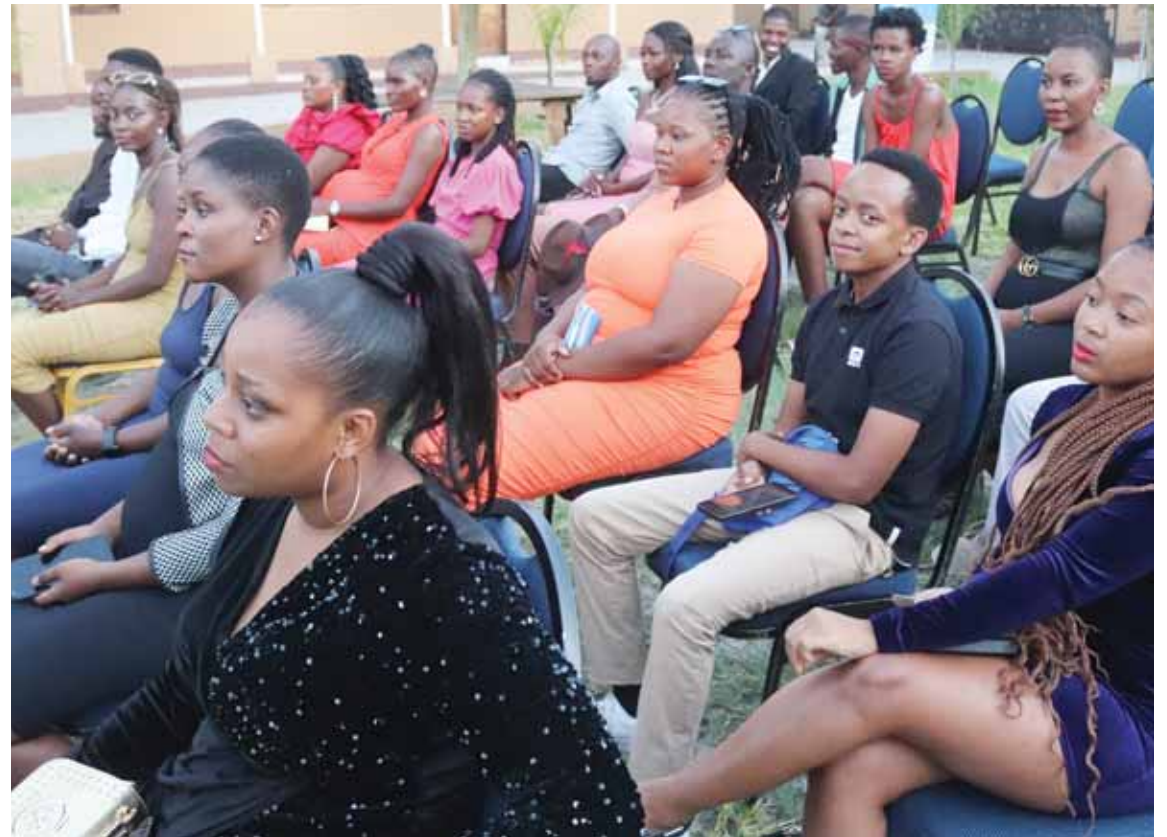
The Youth at the just-ended basic business management training facilitated by MYSC and BIUST in Maun over the weekend. The training aimed to impact the essential knowledge and skills needed to effectively start and run a business.