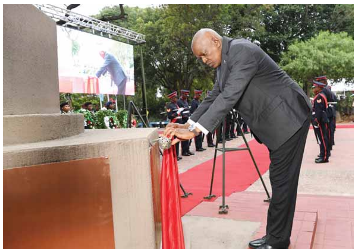
President Masisi unveiling names of the four members of the BDF who lost their lives while on duty at the Fallen Heroes Commemoration Day in Gaborone yesterday.

The meeting gathered heads of anti-corruption agencies from 20 Commonwealth Countries in Africa. BOPA