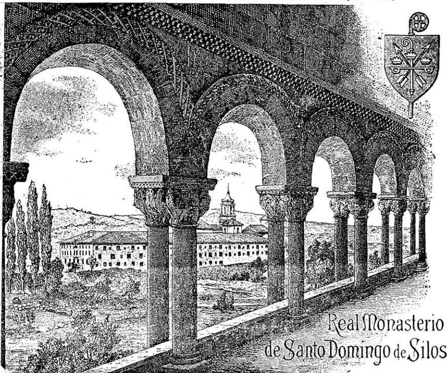
Real Monasterio de Santo Domingo de Sielos

IMPORTANT NOTICE. —The Benedictine Abbey at Fécamp was vacated by the Monks (as were also all establishments of the Order in France) in 1791, at the time of the French Revolution, and was then lost by them for ever. They never re-entered into possession of their Monastery at Fécamp.