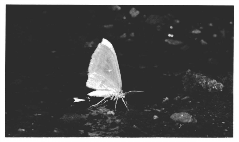
FIG. 1. Male Dyspteris abortivaria Herrich-Schaeffer, a typical discharging species, at wet soil. Arrow indicates formation of a droplet of liquid at the tip of the abdomen.

drank from the cracked bottoms of drying puddles. I observed no female of any species discharge while at soil.