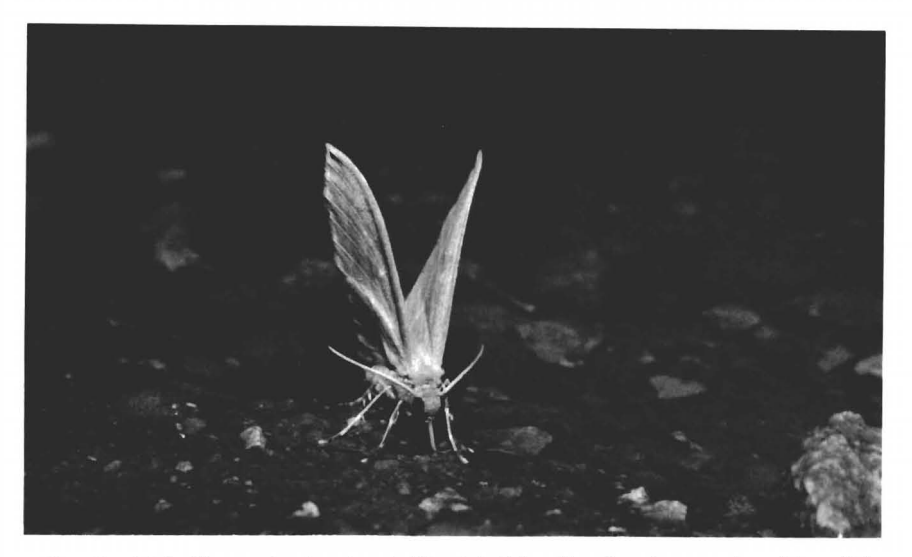
FIG. 3. Male Dyspteris abortivaria Herrich-Schaeffer showing usual position of the wings while visiting soil. Only the apical portion of the proboscis is applied to the water film.

drop size was generally proportional to body size, and when water was freely available, drops were produced at the rate of one or two per second. Suspended soil particles were also passed with the water.