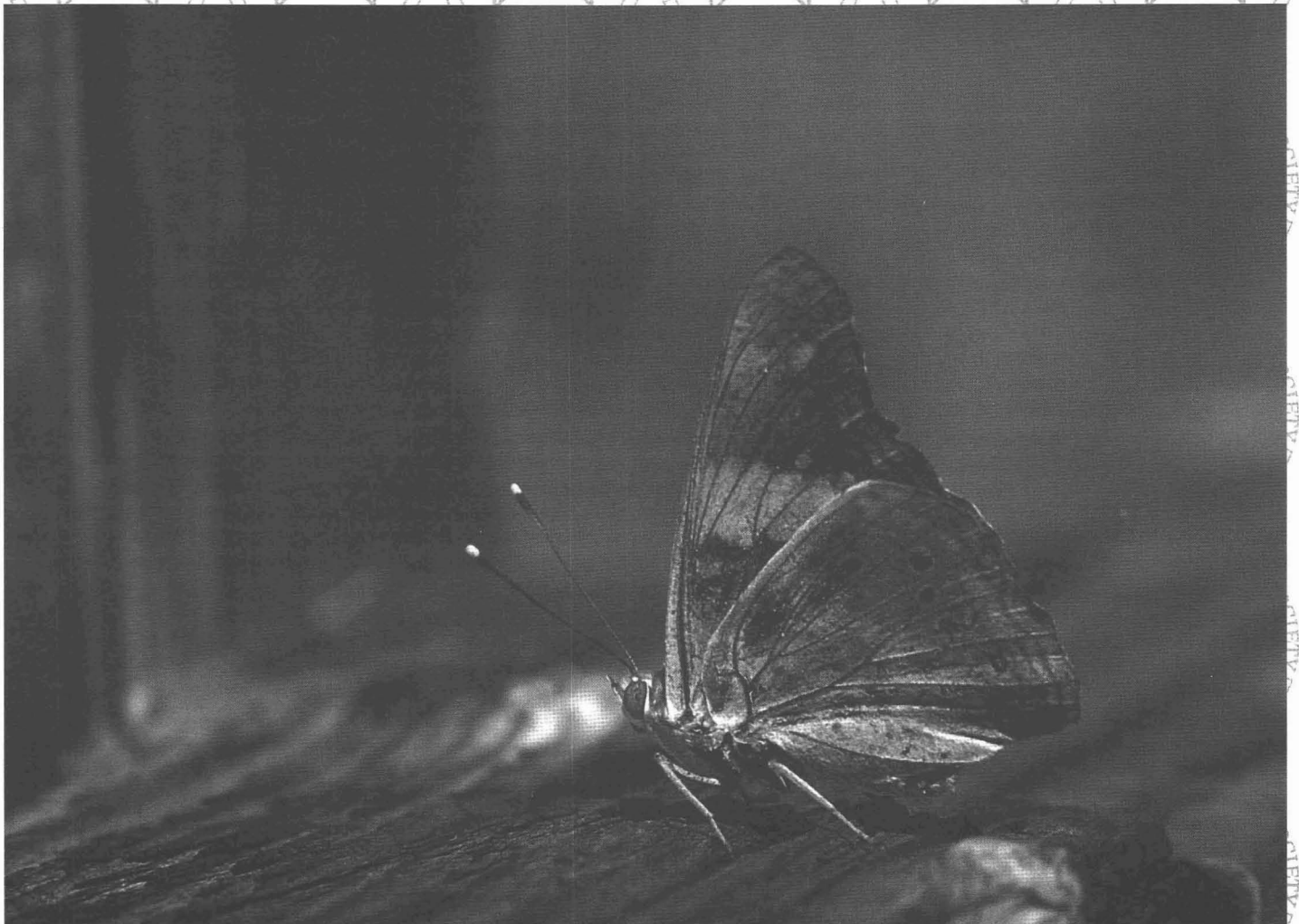
Asterocampa idyja argus, Coronado National Memorial, AZ, 24 th Sept. 1999.