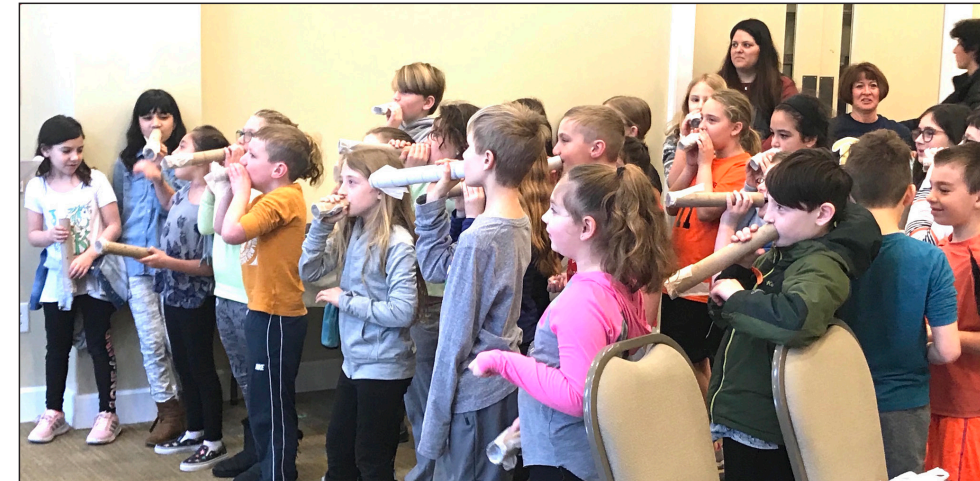
Students blow the kazoos they made with the assistance of the Youth Group. They used their noisy kazoos to drown out Haman's name during the reading of the Megillah, the Purim story.