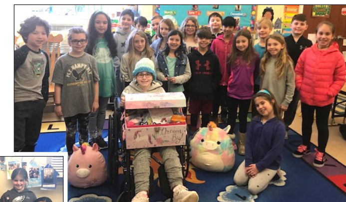
Far left: The Pre-Gan class assembled and donated 100 breakfast bags to the Bucks County Housing Group.