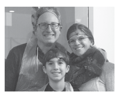
CHRISTMAS DINNER PHOTO GALLERY page 15