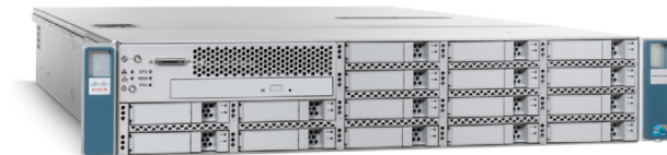
Figure 1. Cisco UCS C210 M2 Server

Designed for applications such as virtualization, network file servers, application servers, appliances, storage servers, database servers, and content-delivery servers, the Cisco UCS C210 M2 server packs up to 16 Small Form-Factor (SFF) SAS or SATA disk drives into only two rack units, for a total of up to 8 terabytes (TB) of storage.