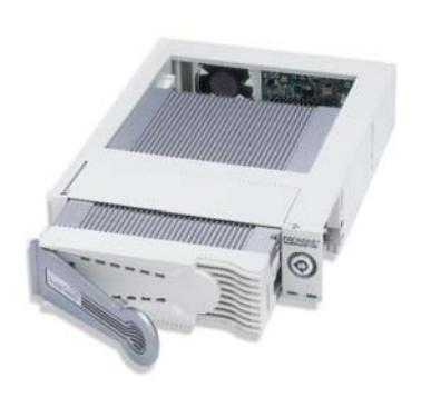
SuperSwap™ II00 :: Available in Charcoal and Beige

For improved functionality with multiple SuperSwap units, the SuperSwap 1100 features a unique Box ID system that simplifies the identification of the enclosure and its associated controller card CH ID or port number.