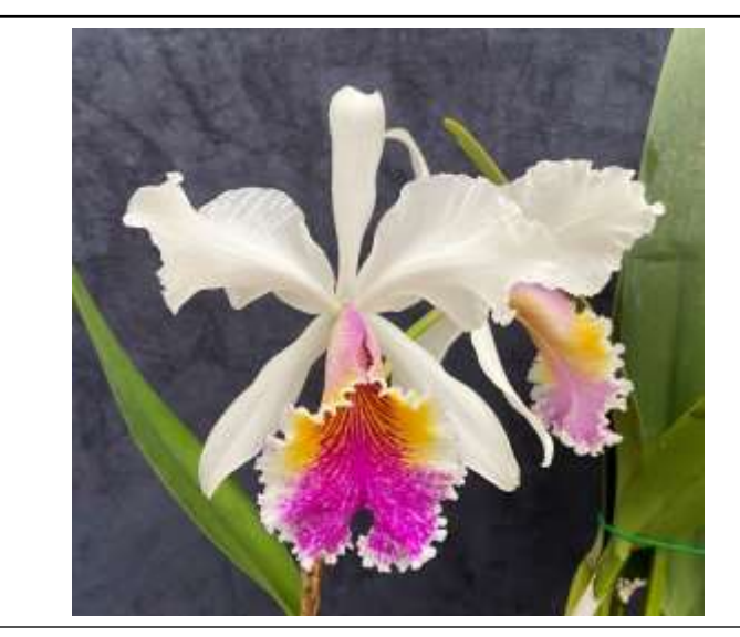
Photo of the Month: A seedling from my father's remake of C Empress Frederick (dowiana x mossiae) from 1888.