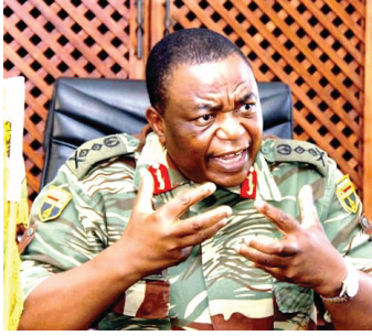
General Constantine Chiwenga, Commander of the Zimbabwe Defence Forces

For example, when he was arrested Klein did not have any paperwork, including KP certificates, RBZ export approvals, or anything that proved whom he had bought the stones from, at what price, and whether taxes had been paid. His passport had no entry stamp, suggesting he had been accorded VIP treatment in circumventing immigration officials upon arrival.