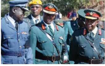
Air Marshall Perence Shiri, head of the Air Force; Lt. General Philip Sibanda, commander of the national army; and General Chiwenga.

Diamonds leaking out of any country in such a fashion is not only a loss to the national treasury and public good, it is the ultimate expression of a systemic failure of a country's internal controls.