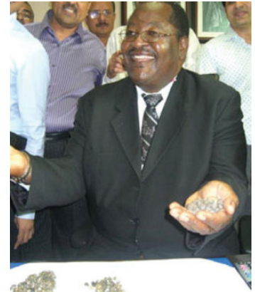
Minister Mpofu visits a diamond factory in Surat, India

– Minister of Mines Obert Mpofu dismisses calls for accountability of diamond revenues, July 26, 2012 1