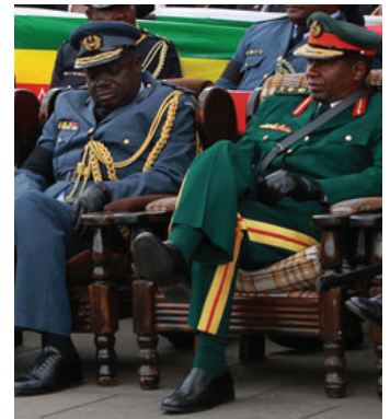
Air Marshal Shiri and General Philip Sibanda

Since becoming Minister of Mines, Mpofu has also made some other interesting purchases—both for himself and some of his companies.