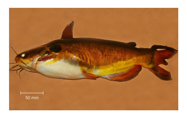
Fig. 3 Horabagrus brachysoma caught from the Kranji Reservoir in Singapore

Horabagrus brachysoma is unspecialized and opportunistic in its feeding habits (Padmakumar et al. 2009; Prasad and Ali 2008; Sreeraj et al. 2006). They are