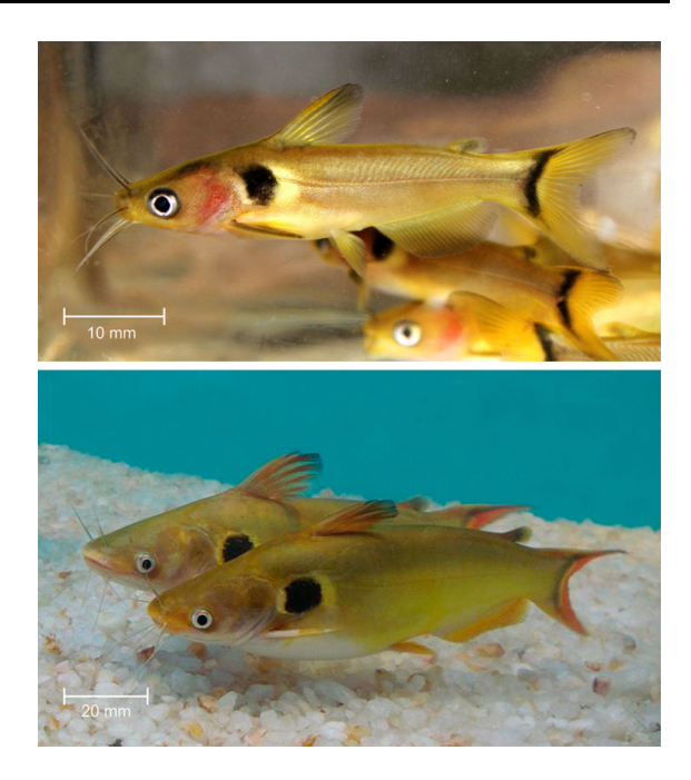
Fig. 1 Fingerling and semi-adult Horabagrus brachysoma

synthesised in the present paper, and future priorities for scientific research to fill existing knowledge gaps discussed.