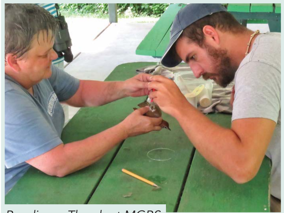
Banding a Thrush at MGBS