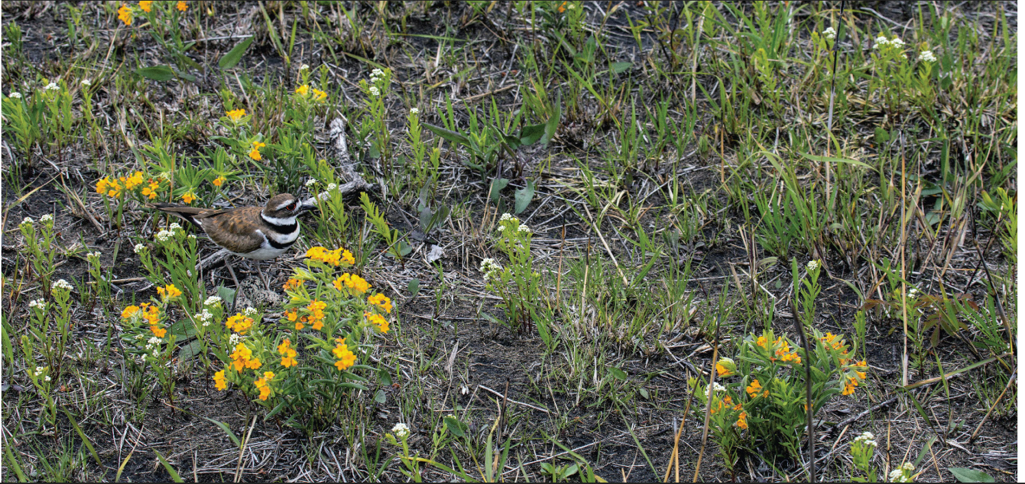
2019 Entry "Killdeer Over Eggs" Photograph by Susan Kirt

A regional, juried art exhibition showcasing artwork of indigenous and migratory birds of the Midwest. Artwork will be displayed at the Indiana Dunes Visitor's Center in conjunction with the Indiana Dunes Birding Festival, an annual event drawing bird-lovers from around the country.