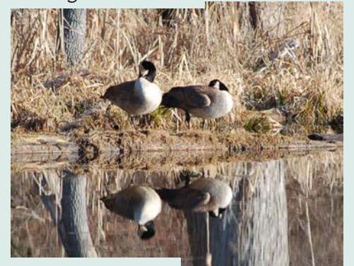
Canada Goose Pair