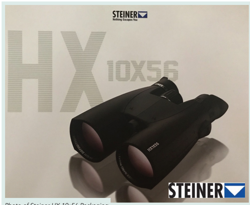
Photo of Steiner HX 10x56 Packaging

Like most high-end binoculars, the Steiner HX come equipped with eye-cups that twist up and down (I wear glasses so I always use binoculars with eye-cups down). In addition to the eye-cups, these have built-in eye-shields - rubber triangular flaps that fold up or down to block out side-light. These eye-shields would likely be welcomed by many non-bespectacled users, however I found them to be a little annoying during general use. The eye-shield flaps, made of rather grippy rubber, would flip up on their own as I moved and used the binoculars. On many occasions, I would raise the binoculars to my eyes only to be met by an outstretched eye-shield poking into the side of my glasses - which forced me to pause, flip it back down, and then locate my target. One other thing that kind of bothered me as I held these in my hand was how my thumb landed right on the thick rubber ridge that runs the length of each barrel. After prolonged use, that ridge can become noticeably uncomfortable.