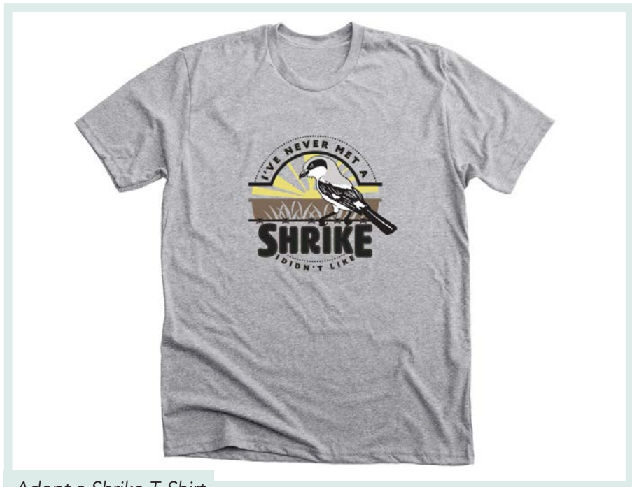
Adopt a Shrike T-Shirt

Remaining shrike breeding pairs now tend to occupy small farms with overgrazed pasture, barbed wire fences, and bushes suitable for nesting. Overgrazed pastures produce bare ground, which provides ideal hunting conditions for shrikes - which need to spot and capture prey on the ground - but little in the way of nesting trees and shrubs. The DNR's current efforts are working to provide shrike nesting habitat by focusing on nest bushes and shrubs along fencerows. In helping with this initiative, IAS and the DNR Division of Fish and Wildlife Non-game program are teaming up for the Adopt a Shrike program. Donors will receive a special adoption certificate highlighting the shrike research and conservation being done, an annual report detailing all the year's shrike banding efforts, and a commemorative "Never met a shrike I didn't like" T-shirt. Each adoption is $50 and can be purchased through the IAS Online Store. Visit indianaudubon.org/adopt-a-shrike to learn more.