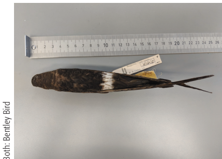
130-131. AMNH 635437 labels.