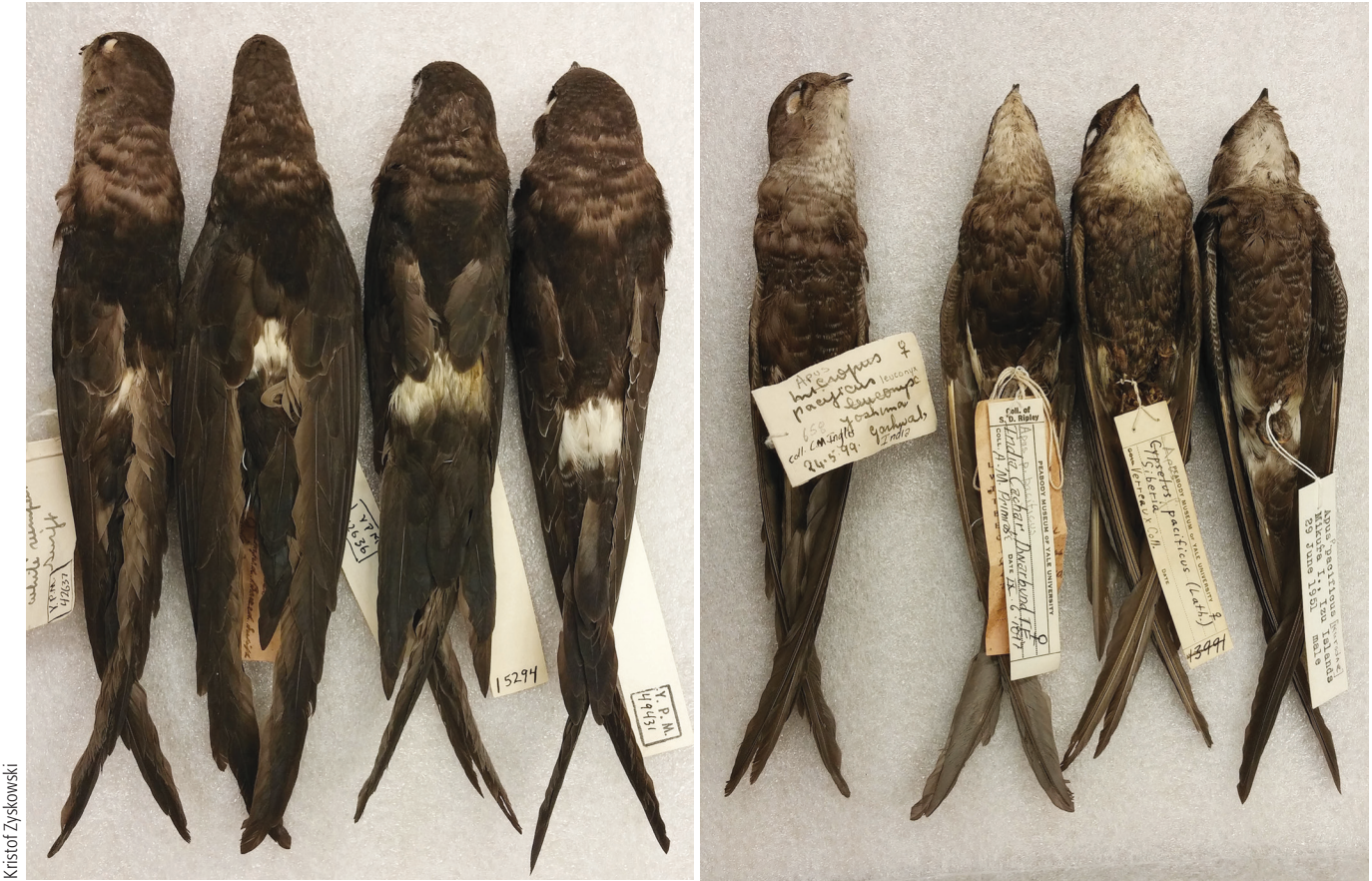
123–124. Dorsal and ventral views of YPM 42637 along with Pacific & Blyth’s Swifts. Skins from left to right: YPM 42636: Blyth’s Swift. India, Uttar Pradesh; YPM 42636: The specimen of interest. India, Assam, Dwarbund; YPM 15294: Pacific Swift. Russia, Siberia; YPM 49431: Pacific Swift. Japan, Izu Islands, Mikura-jima.