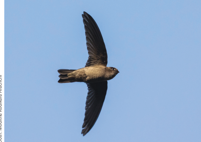
102. Indian Swiftlet showing darker brown underparts with less contrasting undertail coverts. Kandy, Sri Lanka.

tufts of the rump (Chantler & Driessens 1995). Rasmussen & Anderton (2012) described the pale rump and overall paleness as a general feature of the southern Indian population of Indian Swiftlets. Indian Swiftlets therefore, especially birds of the Sri Lankan population, can be told apart with relative ease (especially if they are together) from Himalayan Swiftlets and SAPS based on the overall dark grey-brown plumage, dark rump, which is almost all the time similar in colour to the rest of the upperparts, therefore lacking any contrast [102] , and more uniform dark grey-brown underparts. But even so, paler, Indian Swiftlets of the southern Indian population could be difficult to separate from Himalayan Swiftlets and SAPS.