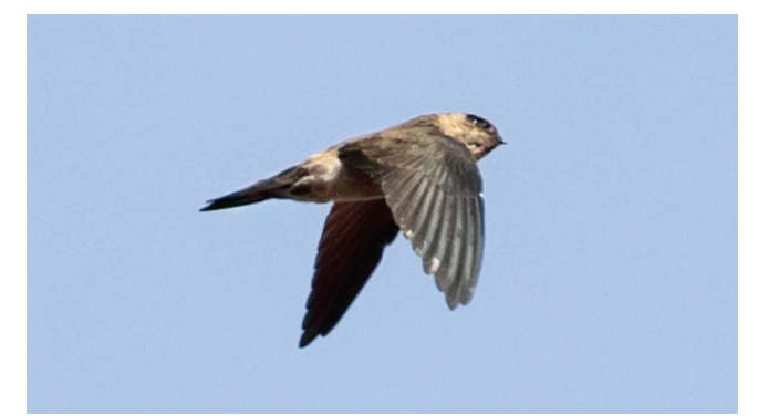
97. Unidentified 'pale-rumped' swiftlet, showing prominent pale rump and pale underparts. Attidiya, Sri Lanka.

On 21 January 2020, MK observed a flock of swiftlets, which had been regularly seen around at Attidiya, Colombo. This flock generally consisted of 15-20 swiftlets but on rare occasions about 200 birds aggregated to feed. MK noted that all these swiftlets had pale grey-brown underparts, a shallow forked tail with dark undertail coverts, and a pale rump band [97–99]. They were slightly smaller than the Indian House Swift Apus affinis. The upper parts were brown, becoming darker, with a bluish sheen, towards the upper wings, and remiges were dark brown with a sheen. The underwing was greyish-brown. They had a pale brownish-grey rump band, grey-brown face, dark iris, a pale supra-loral spot, and pale grey brown throat, breast, belly, and vent. Undertail coverts were dark greyish brown, with outer-most being the darkest. Some birds had pale fringes to dark centered feathers around the vent. Rectrices were dark brown. Tarsi were pale and unfeathered [100]. Bill appeared black.