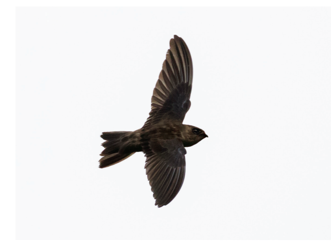
101. Indian Swiftlet showing a relatively more uniform brown upperparts. This individual shows a very indistinct paleness over the rump. Kandy, Sri Lanka.

The Himalayan Swiftlet and SAPS are known to have pale rump bands, which are greyish to brownish-grey in colouration, and contrast with the rest of the darker upperparts. Also, all have pale grey brown underparts, much paler and greyer than that of the Indian Swiftlet (Chantler & Driessens 1995; Rasmussen & Anderton 2012). During our observations we indeed noted very few Indian Swiftlets with a diffused pale rump [101] , but it was very indistinct and never as prominent as on our "pale-rumped" swiftlets, or on Himalayan Swiftlet and SAPS. This feature of some Indian Swiftlets is visible because birds reveal the paler basal