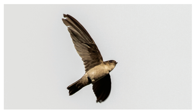
99. Unidentified 'pale-rumped' swiftlet, showing pale underparts and contrasting dark undertail coverts. Note pale supra–loral spot. Attidiya, Sri Lanka.