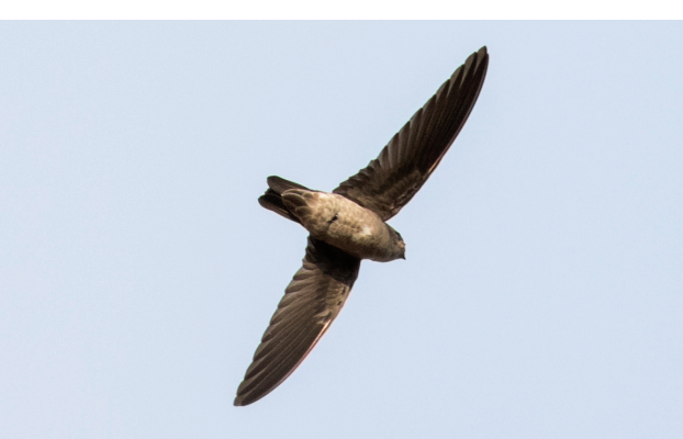
98. Unidentified 'pale-rumped' swiftlet, showing pale underparts and contrasting dark undertail coverts. Nawala, Sri Lanka.