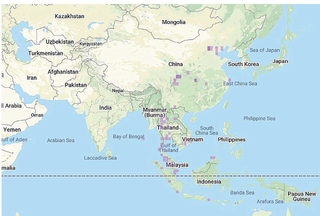
Fig. 2. The distribution of the Zappey's Flycatcher (eBird 2021b).

We thank James Eaton for his comments on the manuscript. We retrieved relevant literature from the online 'Bibliography of South Asian Ornithology' (Pittie 2021).