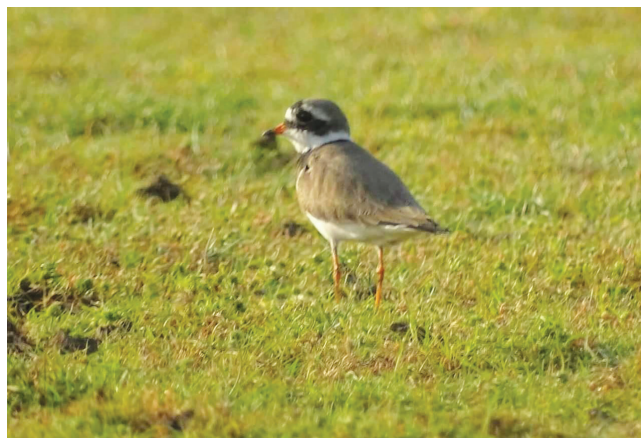
149. Common Ringed Plover in breeding plumage.

Prasad (2004) expressed doubt about records of Common