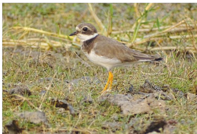
150. Common Ringed Plover in non-breeding plumage.