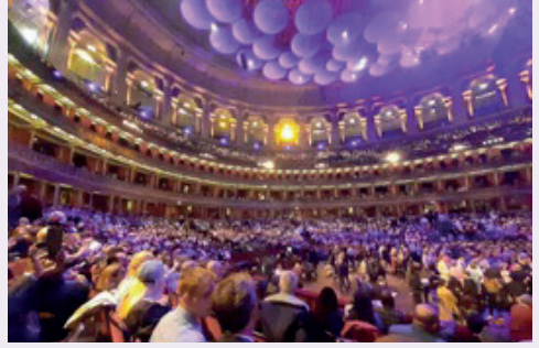
Concert at the Royal Albert Hall