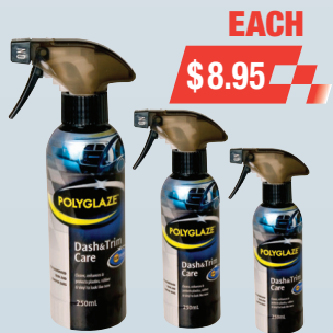
PG23 - POLYGLAZE PROTECTANT DASH & TRIM 250ML