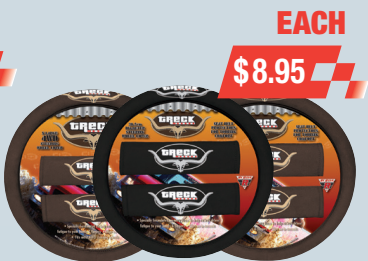
TREKMASTER STEERING COVER BELT PACK