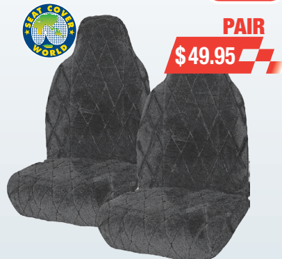
72504-E - RYAN UNI SHEEPSKIN SEATCOVER 60/25 BLACK High back bucket seat covers, covers adjustable headrest.