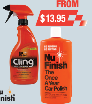
Nu Finish NU FINISH CAR POLISH NFC-09 - CLING SPRAY 443ML...$15.95 NF-76 - CAR POLISH 473ML.....$13.95