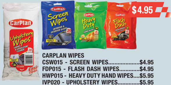
CARPLAN WIPES CSW015 - SCREEN WIPES.....$4.95 FDP015 - FLASH DASH WIPES.....$4.95 HWP015 - HEAVY DUTY HAND WIPES.....$5.95 IVP020 - UPHOLSTERY WIPES.....$5.95