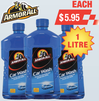
ACW1 - ARMOR ALL CAR WASH 1L Powerful cleaning & streak free shine