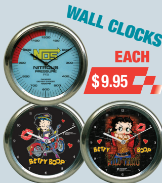
WALL CLOCKS NOWC15 - NOS CHROME EDGE..$9.95 BETTY BOOP WALL CLOCKS BBWC - BIKER BETTY.....$9.95 BWWC - WILD THING.....$9.95