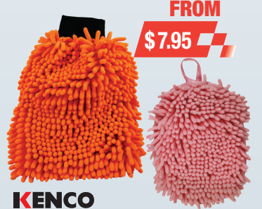
KENCO KENCO NOODLE 2 IN 1 WASH MITT 56207 - MICRO MESH ORANGE.....$7.95 56990 - PINK HYPER-ABSORBANT...$8.95