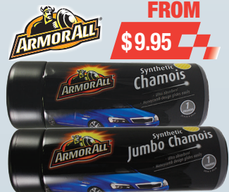
ARMORALL CHAMOIS ACHAMOIS - SYNTHETIC.....$9.95 ACHAMOISL1/4.2 - JUMBO....$13.95