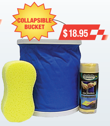
RG9423 - 3 PIECE CAR WASH KIT Collapsible 11L bucket with sponge & synthetic chamois.