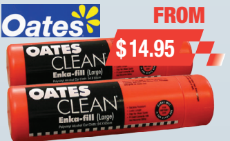
OATES ENKAFILL CAR CLOTH PV-EF-01 - 37X43.....$14.95 PV-EF-06 - 54X65CM.....$26.95 Bacteria resistant, lasts longer Has no weak spots, Polyvinyl alcohol car cloth.