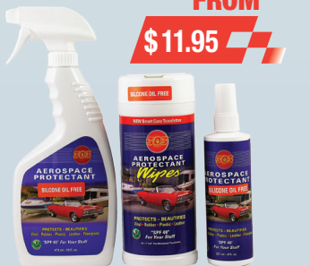
AEROSPACE PROTECTANT 30330 - 303 SPRAY 237ML.....$11.95 30340 - 303 SPRAY 473ML.....$19.95 30910 - 303 WIPES 40 PACK...$19.95