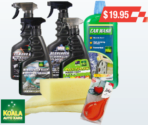
KAK10-01 - KOALA ULTIMATE KLEEN KIT 10PCE Car wash 473ml, Armor Kote & sponge, Degreaser, windscreen cleaner, 3 Juice air fresheners & much more...