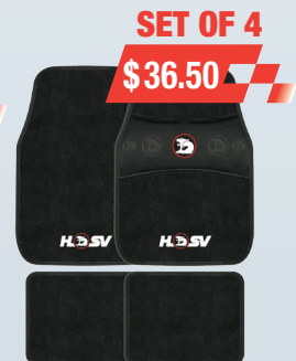
CMHHSVBLKS4 - HSV CARPET MATS SET OF 4 - BLACK/RED Fits most cars, non slip backing, durable quality carpet.