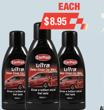
CPPOL105 - CARPLAN ULTRA CAR WAX 500ML