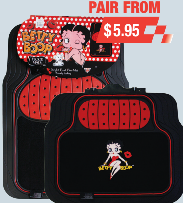
BETTY BOOP FLOOR MATS B2S04 - FRONT MAT BLACK.....$9.95 B2R04 - REAR MAT SET OF 2.....$5.95