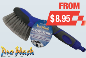
PW40102 - PRO WASH COMPACT FLOW-THRU BRUSH.....$8.95 Easy to use, control the flow.