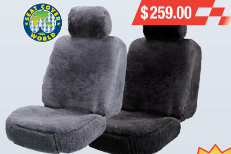
JADE SHEEPSKIN SEAT COVERS Three star high quality sheepskin cover, front personal and rear map pockets, foam padding, heavy duty fasteners.