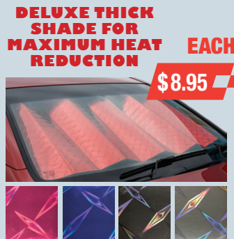
SUNSHADES 147cm x 70cm. 4mm thickness. Includes suction cups.