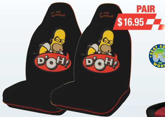
SD2504 - SIMPSONS DOH! SEAT COVERS 60/25 Black