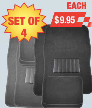
UNIVERSAL FIT CAR MATS RG1957BK - BLACK.....$9.95 RG1957DG - GREY.....$9.95 - Heavy duty non-slip back. - Easy to clean, universal fit