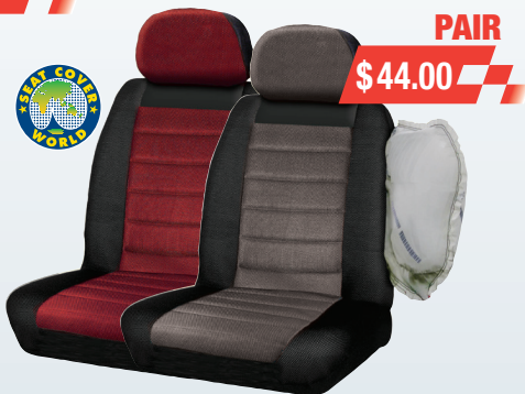
CARBON SEAT COVERS WITH AIRBAG Carbon fibre look, airbag compatible.