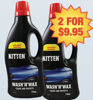
KITTEN 17215 - KITTEN WASH N WAX 750ML