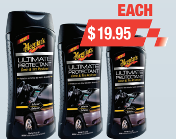
G14512 - MEGUIARS ULTIMATE PROTECTANT - 355ML Dash & trim restorer, protection & shine lasts weeks, interior & exterior.