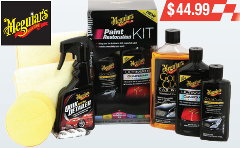
G3300 - MEGUIARS PAINT RESTORATION KIT Car Wash 473ml, Carnauba Plus Wax 175ml, Ultimate Compound 300ml