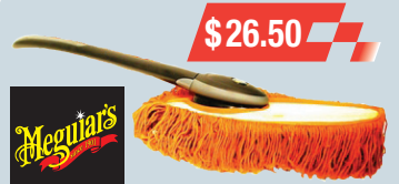
X1083AU - MEGUIARS WATERLESS BODY DUSTER