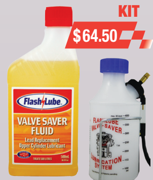
AFUCL1 - AUTOFORCE UPPER CYLINDER LUBE 1L - Formulated for LPG Lube Drip Feed Kits - Treats up to 600L of petrol or gas