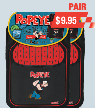
PC2S04 - POPEYE FLOOR MATS SET OF 2 BLACK