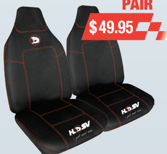
MHHSVRED60 - HSV MESH SEAT COVERS (PAIR) Map pocket, machine washable, breathable mesh fabric.