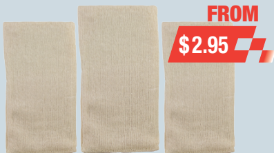
POLISHING CLOTH PW50200 - 100CM X 30CM 200GSM...$2.95 PW50201 - 200CM X 30CM 200GSM...$4.95 PW50202 - 500cm X 30CM.....$9.95