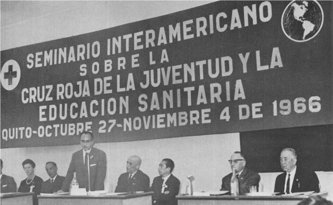
Ecuador, November 1966 — Inter-American Seminar on Junior Red Cross and Health Education.