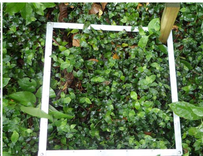
The stick in the corner shows the substantial change in height of tradescantia between 2011 [39.2 cm, left] and 2018 [13.4 cm, right].