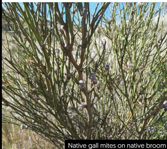
Native gall mites on native broom

Lynley Hayes – hayesl@landcareresearch.co.nz