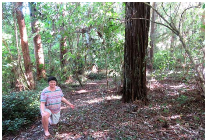
Kings Rd, Northland, in spring 2016 and again in January 2018. Leaf beetles were released here in March 2015 and stem beetles in December 2016.