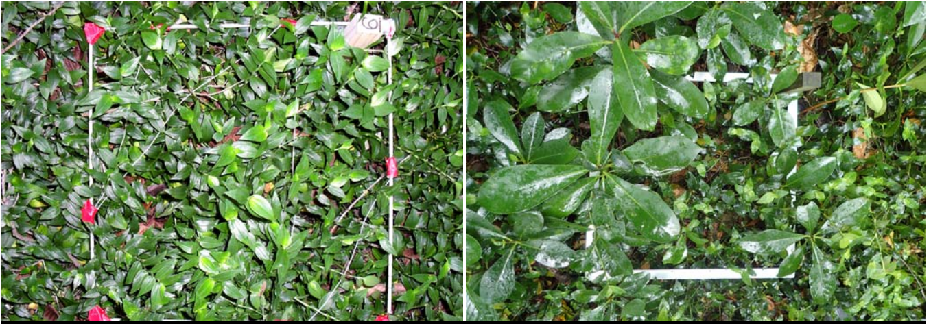
Mt Smart, Auckland, before [2011] and after [2018] leaf beetles were released, showing tradescantia decline and resurgence of native plants.

still relatively early days and we would expect the impacts of the beetle to become even more apparent over time,” said Quentin.