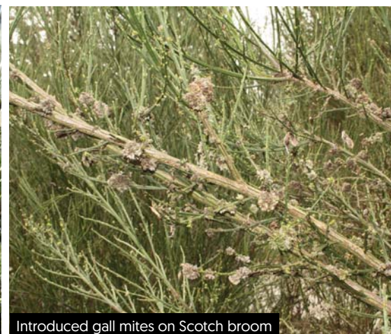
Introduced gall mites on Scotch broom