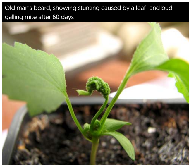
Old man's beard, showing stunting caused by a leaf- and bud-galling mite after 60 days

Lindsay Smith – smithl@landcareresearch.co.nz