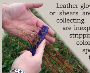
Small comb teeth strip seed from little blue stem; large comb teeth for coarse grasses like big bluestem and Indian grass.

Good quality scissors and plastic combs are handy tools. Keep both hands free for collecting by attaching collecting bags around waist.