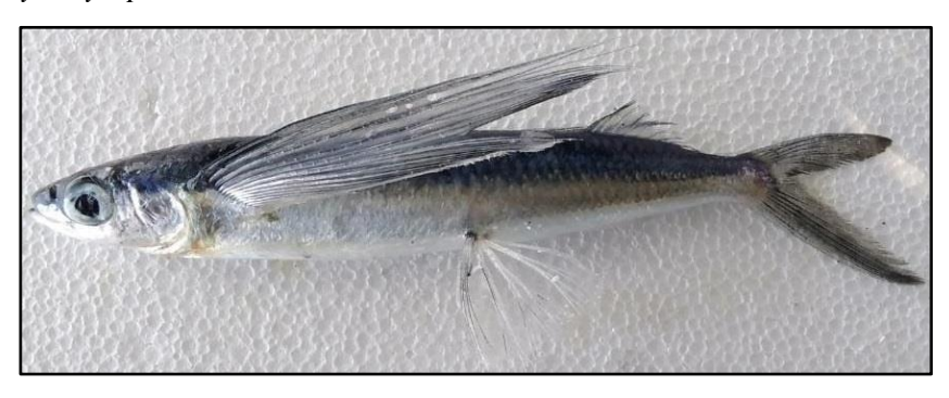
Figure 4. Hirundichthys oxycephalus

The maximum standard length is about 18 cm. Pelagic in nearshore and neritic surface waters. It is a small pelagic fish that is important for Vietnam, Indonesia, and the Philippines. Distributed in the Indian Ocean and the Western Pacific from the Arabian Sea to the southern Solomon Islands, and New South Wales (Australia) [7].