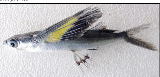
Figure 1. Cheilopogon spilopterus

Maximum standarard length 25 cm. Pelagic fish on the surface close to the coast and neritic. Distribution of this type of fish in the East Indian Ocean and Western Pacific [7].