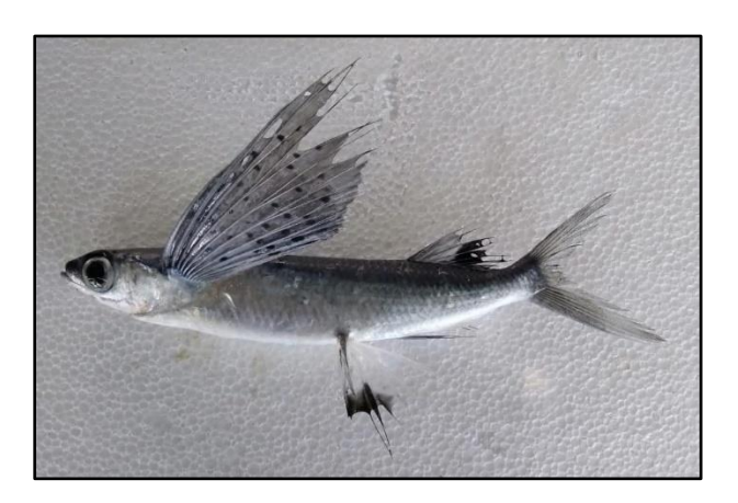
Figure 2. Cheilopogon abei

Maximum standard length is 22 cm. Pelagic fish on the surface close to the coast and neritic. Distribution of this type of fish in the Indian Ocean and West Pacific Ocean [7].